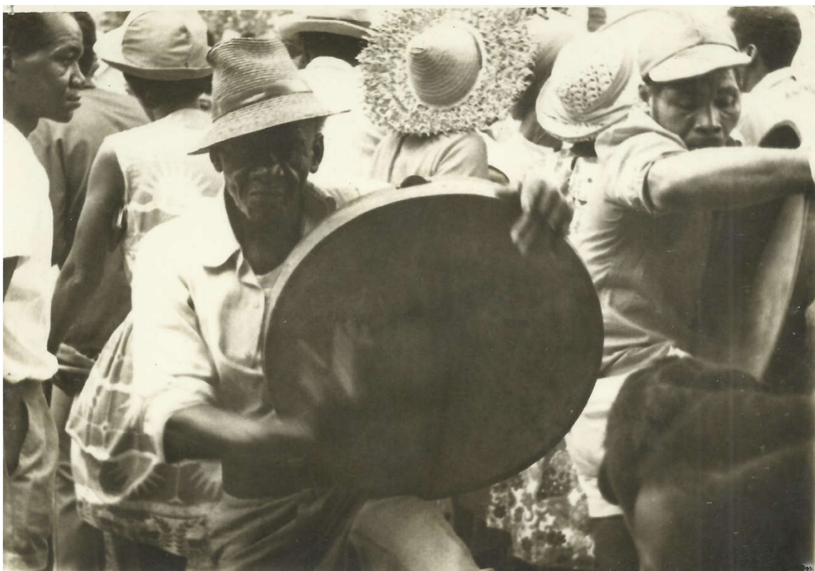
Fig. 2. Picture showing a moutya dance during an SPUP political manifestation in [1978?].

after the establishment of the Second Republic. 259 The SPUP used the moutya as a forum for gathering the masses against the colonial government and even went as far as to declare the moutya singer ‘the new politician of the day’ in one of their early publications. 260 The moutya was ideal for gathering the masses not only because it represented a suppressed genre that belonged to the oppressed masses, but also because from its earliest known use, it expressed resistance to slavery. The moutya then was at the forefront of the Seychellois cultural and political revolution promoted by the government of the Second Republic, together with the language of its expression, Kreol.