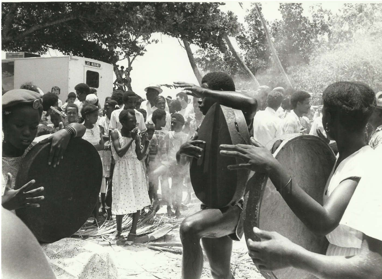
Fig. 3. 'Young Pioneers' of the Second Republic being taught to play the moutya drums [1985?].