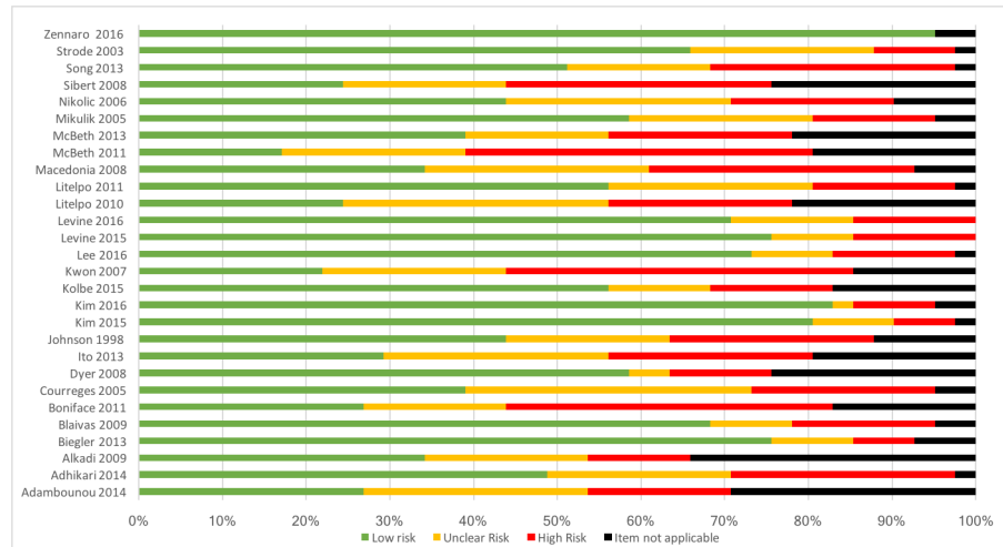
Fig 2. Critical appraisal results. Articles were marked as high, unclear, low risk or item not applicable according to 41 items, in the 7 domains described previously. Please see S5 Table for a domain specific representation of the risk of bias for each study.

https://doi.org/10.1371/journal.pone.0194840.g002