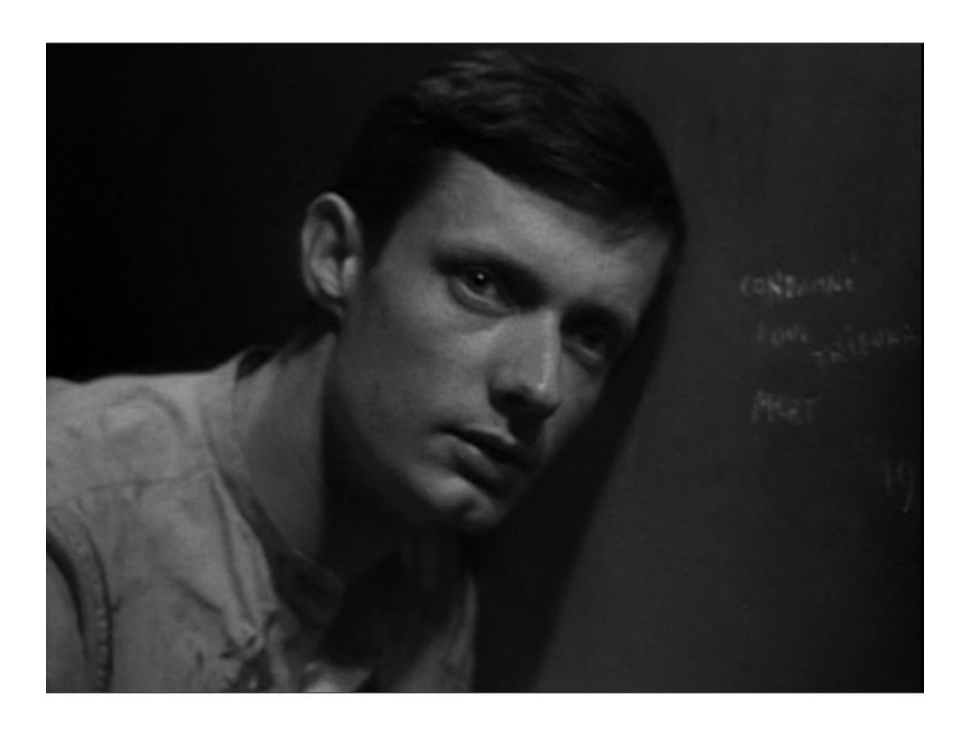
Sounds coming from the (invisible) city

Robert Bresson, Un condamné à mort s'est échappé (1958)