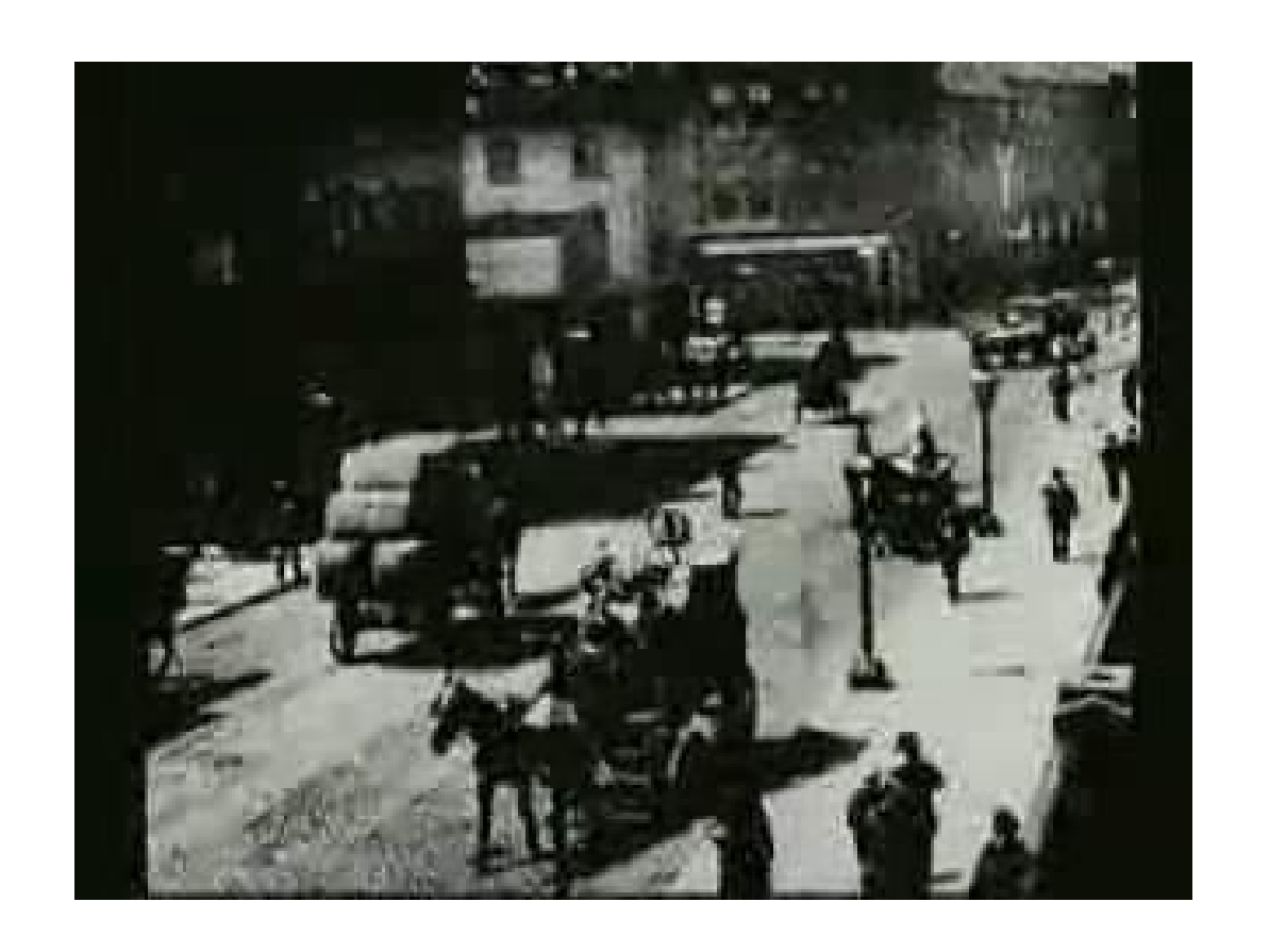
Louis Le Prince, Traffic crossing Leeds Bridge, 1888