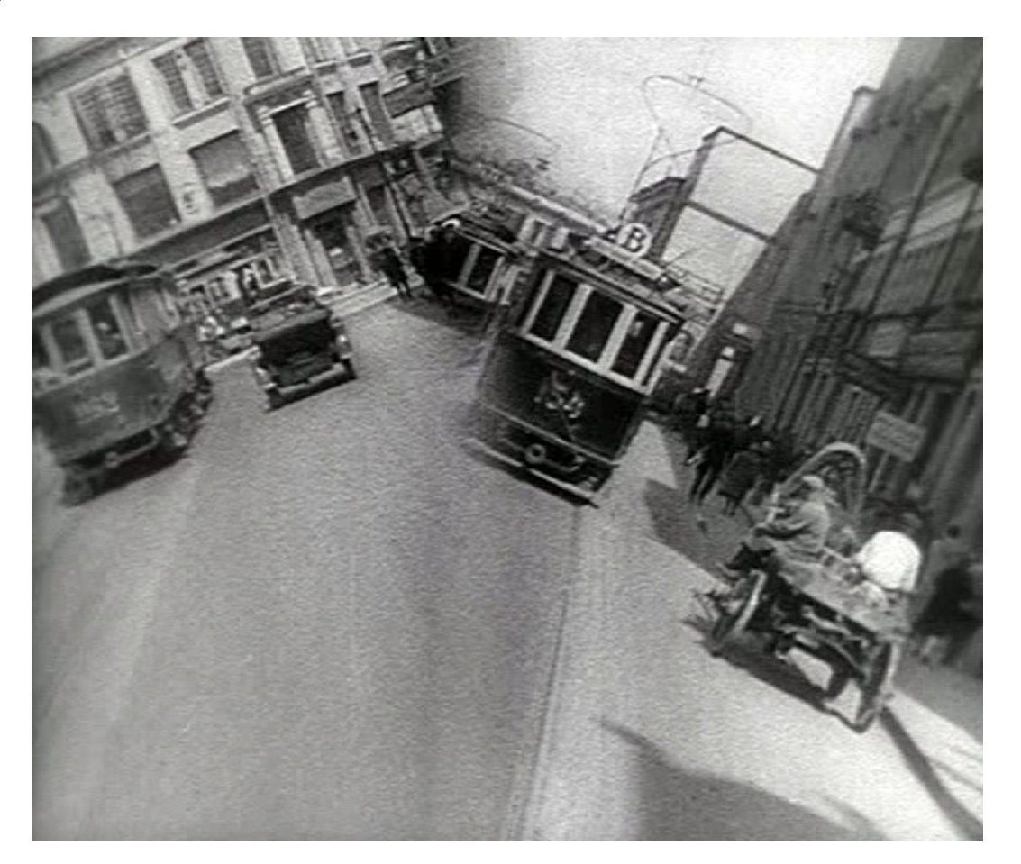
Dziga Vertov, The Man with a Movie Camera (1929)