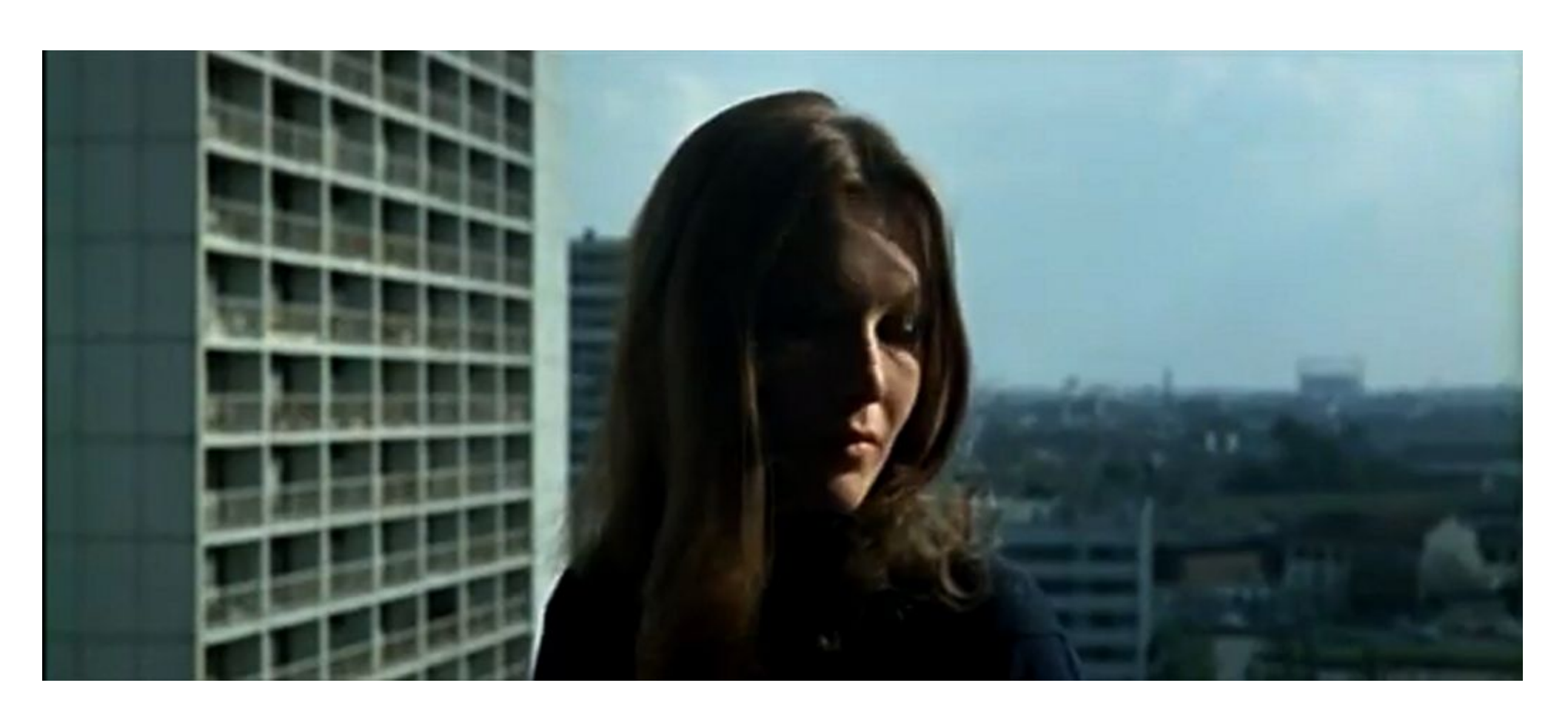
The acoustics of the "Grands ensembles"

Jean-Luc Godard, Deux ou trois choses que je sais d'elle (1967)