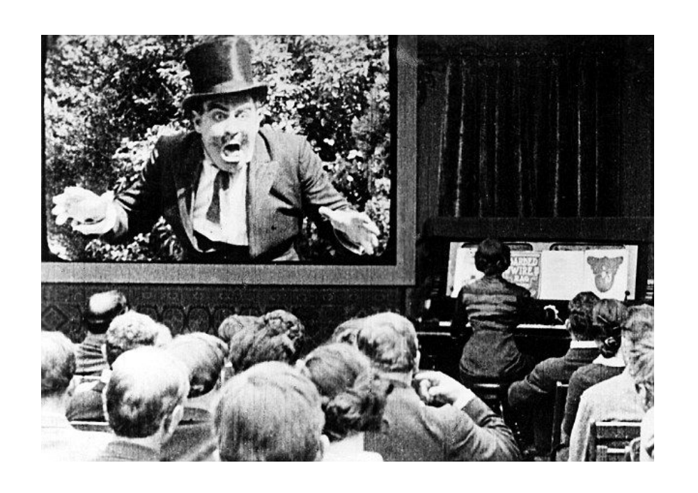
Sound in the silent film era

Screenings were often accompanied by music, mostly played live, but also recorded on disc, and sometimes even by sound effects, by narrators' voices that commented on certain scenes and sometimes improvised characters' voices.