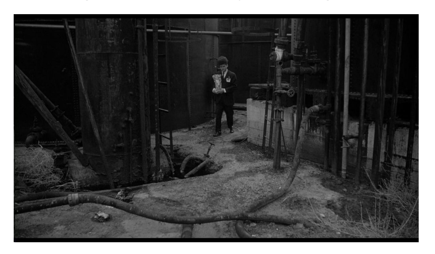
The urban industrial soundscape