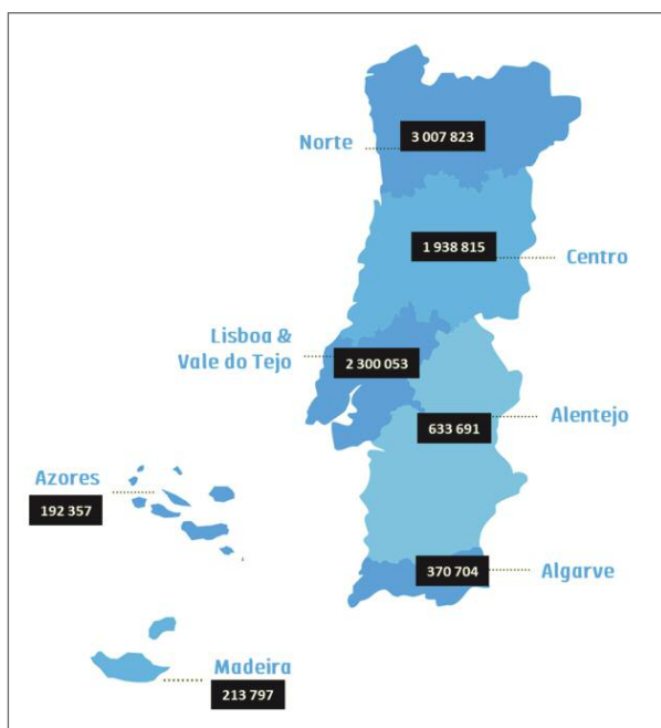
FIGURE 1. Portuguese population density distribution according to NUTS II NUTS II- Nomenclature of Territorial Units for Statistics (Norte, Centro, Alentejo, Algarve, Lisboa, Madeira and the Azores)

old) decreased from 16% in 2001 to 5.1% in 2011. Among the elderly population (>65 years-old) the opposite trend was observed, rising from 16% in 2001 to 19% in 2011 13 .