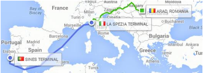
“Italy route” image

• The “Croatia route” involves also more than one country: 2 suppliers from Romania and one from Hungary, however they are geographically close to each other. The load seaport of this route is Ploce, a Croatian seaport, because is the one closer to suppliers and has the same transit time of other Croatian seaports available. Despite the reasons above mentioned of the Italian seaport being advantageous because have lower transit times, it was considered a route from Croatia because the maritime transportation costs are very similar between Croatian and Italian seaports and with this route was aimed the saving in transportation costs between suppliers and seaports. The suppliers’ collection process is also the “milkrun” collection, and the nearest containers terminal for collect the empty container is in Budapest. The total transit time of this route is 16 days: 14 days by maritime transport (the ship make a transshipment in Gioia Tauro, Italy), one day for parts collection from suppliers and one day in Portugal to unload the cargo from ship and arrive to VW Autoeuropa.