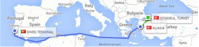
“Turkey route” image

• The “Italy route” is more complex since involve several countries: Italy, Romania and Hungary and a total of 9 suppliers. The load seaport for this route is La Spezia, in Italy, because from all Italian seaports where MG2 operates, this is the only that offer a weekly frequency of 4 shipments direct to Sines with a maritime transit time of merely 6 days. In this route the parts collection process is also “milkrun” collection and then is delivered all the cargo in the La Spezia seaport. The empty container terminals used can be Budapest for Romania and Hungary and La Spezia for the Italy region. Arrived to Sines seaport all the cargo will be delivered by MG2 to VW Autoeuropa factory. In total, this route will have 9 days of transit time, because, additionally to the 6 days of maritime transit, it is necessary 2 more days for collect parts from all suppliers involved and finally from Sines seaport to VW Autoeuropa facilities takes one more day of journey.