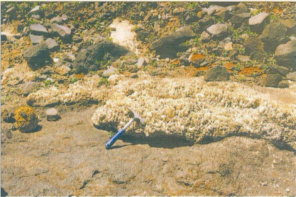
Fig. 2 - Detailed view of the Upper Pleistocene fossiliferous sands.