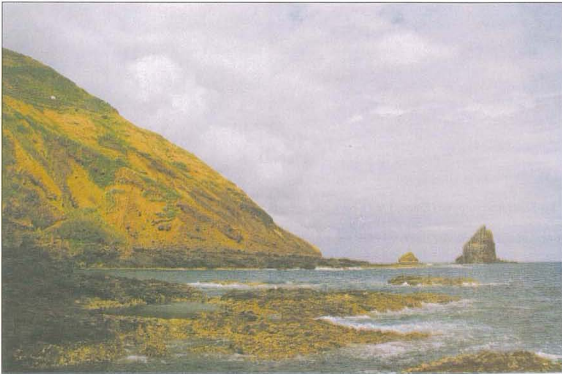
Fig. 1 - The northern coast of Santa Maria, near the bay and islet of Lagoinhas, with the 2-3 meters platform exposed at low tide.