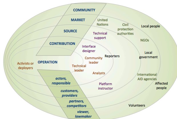
Fig. 2. - Stakeholders Identification Diagram

The stakeholder analysis evidences the complexity and diversity of actors involved with the socio-technical system, enabling a systemic view of the forces (expectations, concerns) from the interested parties [9]. All the interested parts mentioned by the community leaders during the interviews are represented in the layers of the Stakeholders Identification Diagram (SID) [9] (Figure 2).