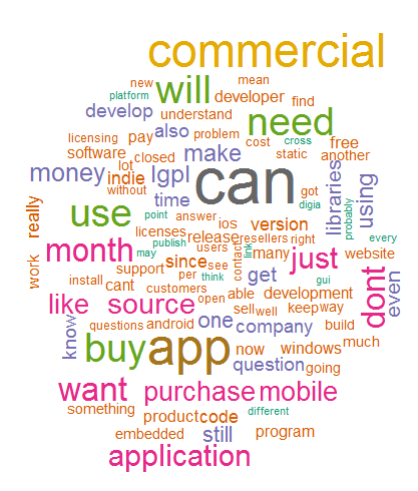
Fig. 1. Wordcloud displaying the top frequent 100 words.

Thus, the frequent words gave some context of the conversation around the sales leads. Furthermore, in comparison to our identified sales lead indicators, the most frequent terms were 'buy' and 'purchase'.