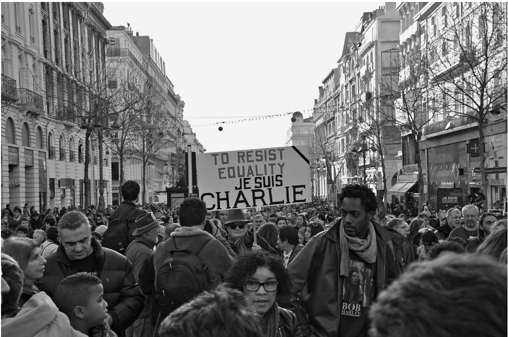
Photo 2. Ritual march in Marseille.