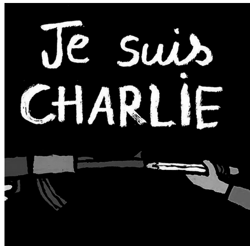
Figure 2. Je Suis Charlie drawing (H.KoPP 2015).

When we analyse the mourning rituals performed in the digital mediascape after the Charlie Hebdo attacks we need to acknowledge a close interplay between the physical and the digital ritual practices of mourning. In mourning practices, Paris was constituted as the ritual centre of the events. The digital mediascape was filled with news and social media images of people gathering in silent demonstrations on the streets, squares, and plazas to mourn and to pay respect to the victims of the attacks. I consider taking and sharing these pictures in the digital mediascape a ritual practice demonstrating solidarity and compassion for the victims of the attacks. As Roncin put it “we’re trying to feel a community [...]. It is very reassuring to be all together whenever there is something horrible happening.” (Devichand 2016) Typical of the digital mediascape, these images were produced by professional and ordinary media users alike and followed a repetitive pattern of symbolic communication, crystallised around the message “Je suis Charlie”.