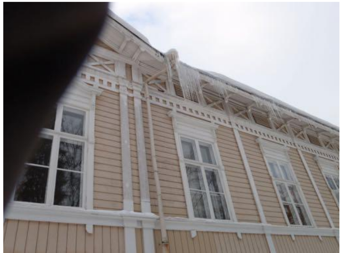
Figure 4. Spring weather.

In the example below, Anna explains that she wants to capture the beautiful spring weather, because it is an important source of her happiness and positive emotions (Figure 4). According to Anna, it has not been an easy task, and she explains how she has engaged in creative problem-solving to document this abstract experience.