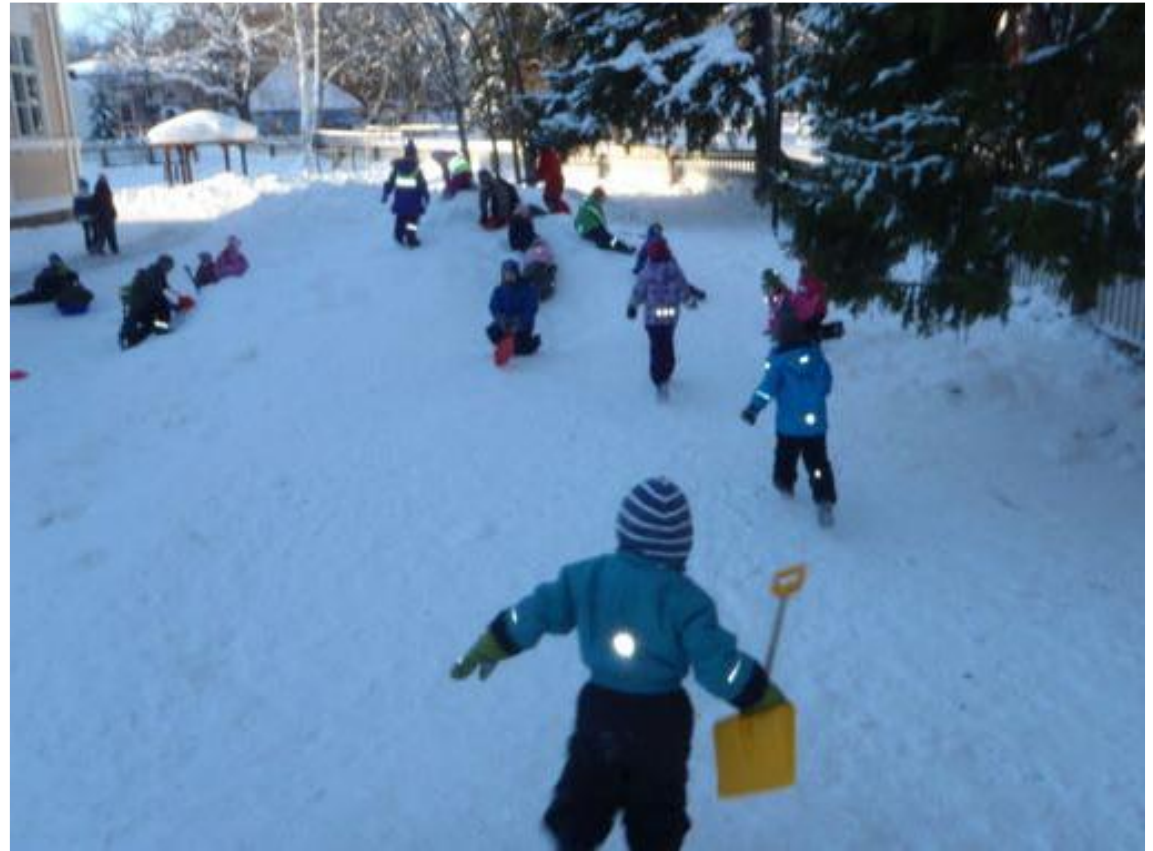
Figure 5. Running like the wind.