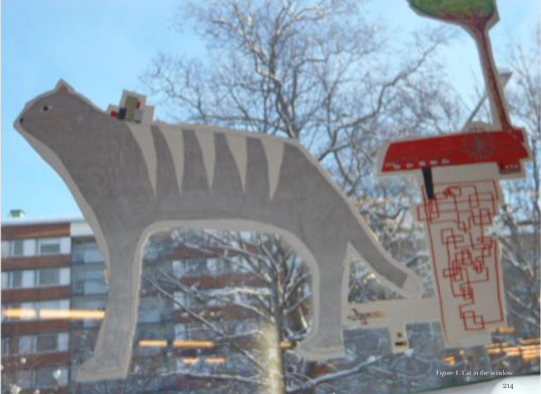
Figure 1. Cat in the window.