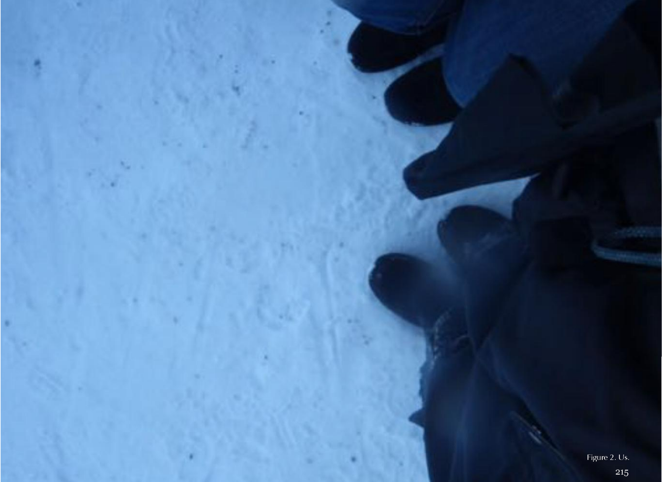
Figure 2. Us.