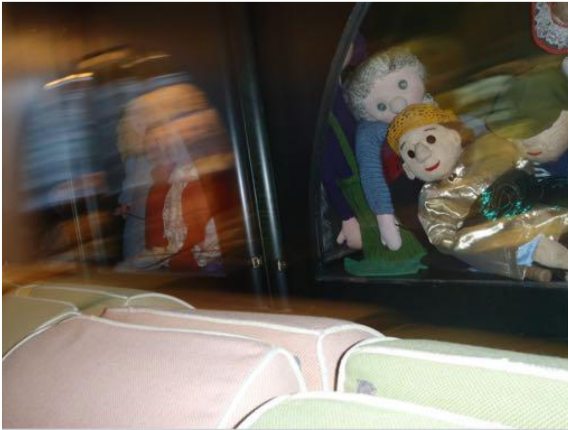
Figure 6. Doll on the move.