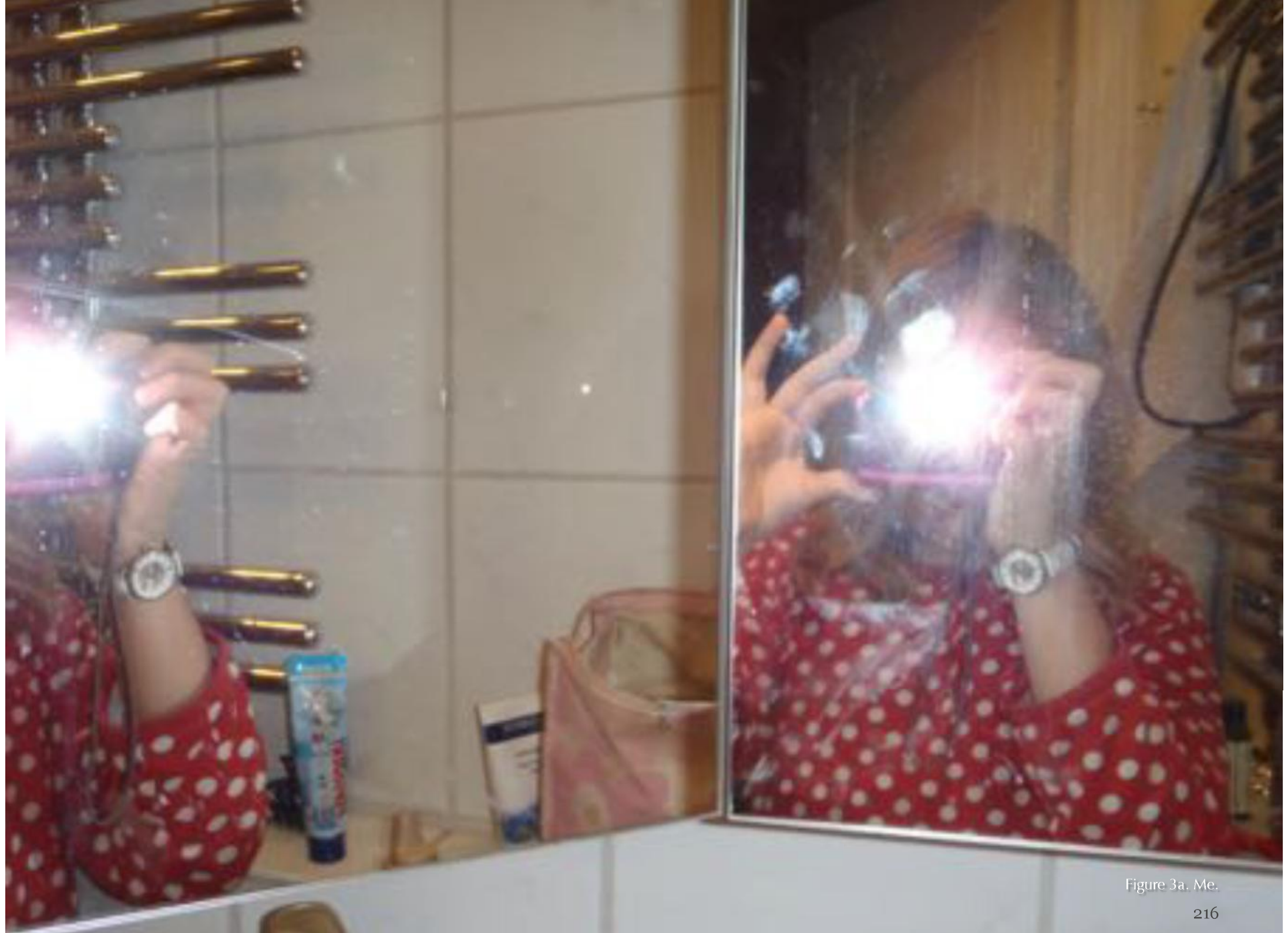
Figure 3a. Me.