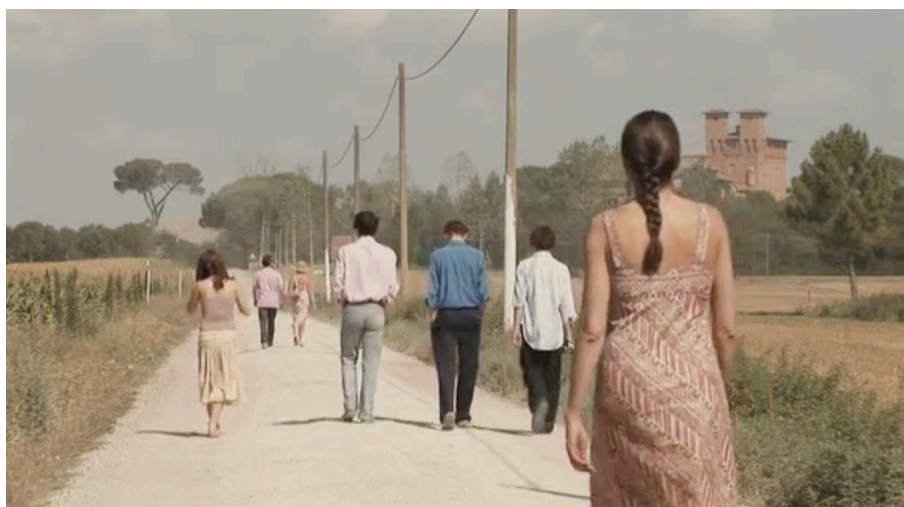
Protagonist Anna of Unrelated is set apart from the family group as a childless woman. Screenshot.