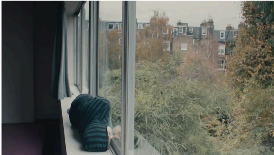
D experiencing physical communion with the domestic space. Screenshot.