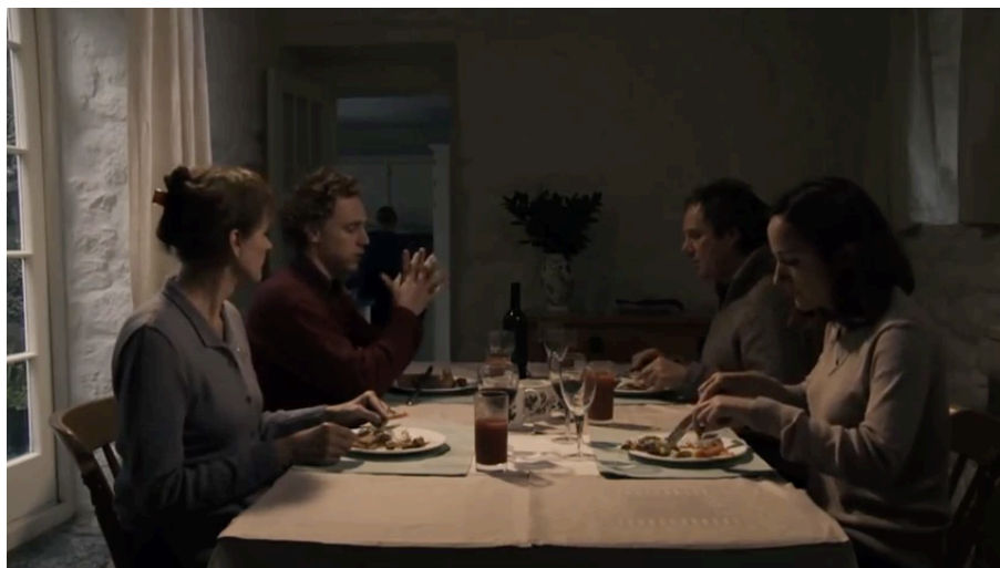
Archipelago is set within the domestic-female space of melodrama. Screenshot.

This appears to be beyond the grasp of middlebrow critics whose attempts to separate Hogg's work-as-art from the generic implicitly denigrate aspects of her films which are iconically melodramatic: their domestic setting, focus on female protagonists (who are all in some way conflicted by their choice either to act out or reject a maternal role), and indeed their juxtaposition of "melos" or music/sound in relation to and/or as commentary on the drama/story. This, again, is despite Hogg's noted attempts to steer deconstructive analysis of her films away from considerations of class and style and towards a more sustained discussion of abstract concepts in her films, such as female sexuality and the body's relationship to place versus space (Salovaara; Fuller). This is not to say that readings of the implicit significance of class, for instance, in Hogg's work are necessarily invalid; yet it is notable that those critics (Roddick; Romney; Dallas) who have probed her films for an authorial mark have tended to fixate on this particular trope—the significance of which the director herself has discounted—without giving equal analytic weight to certain other outstanding narrative constants within Hogg's three releases to date, particularly their preponderance of middle-aged female protagonists and their firm location within domestic/private spaces.