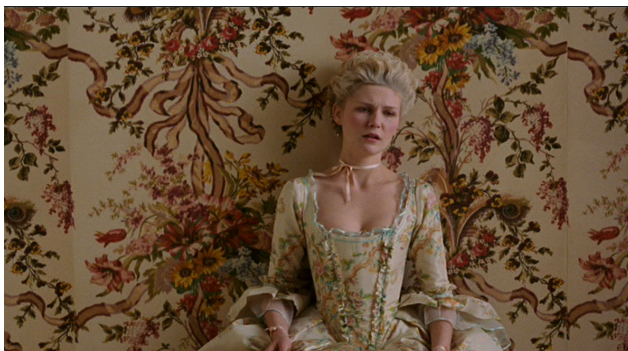
Figure 1: Identifying with Marie-Antoinette as the vulnerable object of the gaze. Marie Antoinette (Sofia Coppola, 2006). Sony Pictures, 2006. Screenshot.