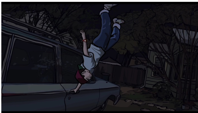
Figure 1: “Dream is destiny”. Waking Life (Richard Linklater, 2001). Twentieth Century Fox Home Entertainment, 2003. Screenshot.

In the opening sequence of Waking Life we see a boy and a girl playing with an origami fortune teller (a “cootie catcher”), the boy’s random picks of colours and numbers resulting in the words “Dream is destiny”. The words act as a cue for the entrance of gentle piano arpeggios and a melancholy accordion melody accompanying an image of the boy looking at the sky, his feet slowly leaving the ground, as if he is being pulled up or drawn to something above him. Before floating skywards the boy grabs the door handle of a car parked beside him and then we see Main Character waking up on a train, suggesting that the scene with the boy could be a