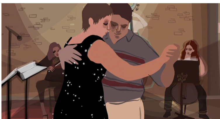
Figure 4: Tango is about connection and intimacy. Waking Life . Twentieth Century Fox Home Entertainment, 2003. Screenshot.

According to connoisseurs, connection is the very raison d'être of tango as well. The dance relies on partners knowing their technique; it is structured and stylised but the fact that the steps can vary widely in timing, speed and character allows dancers to express their individuality and mood from moment to moment. Most of all, though, tango is meant to make partners feel safe and comfortable enough to express their authenticity and vulnerability so that they can experience the connection with each other: “the shared experience of dancing seems to take us as a whole ... all of a sudden the movement of one body seamlessly fits with the movement of another, the musical intuitions and emotions of both dancers so attuned that for the duration of at least that one tango we seem to become a single blissful entity” (Pucci).