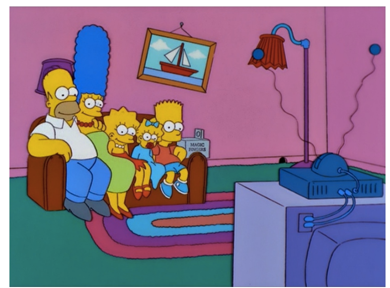
Figure 9: "Behind the Laughter": couch gag. The Simpsons: The Eleventh Season . 20th Century Fox Home Entertainment. 2008. Screenshot.

Furthermore, analogously to what noted for Surf's Up , the documentary aesthetics here deployed are applied to the traditional narrative structure of The Simpsons' episodes in order to innovate the way of recounting its curious characters' adventures. Indeed, as all other episodes in the series, these two also focus "on the day-to-day trials and tribulations" of such yellowish figures, "introducing a new element that throws the family's staid life into disequilibrium and then following the resulting attempt to return to stasis" (Turner 30). In "Behind the Laughter", the new factor in question is represented by the fame that, it is pretended, the Simpsons' family members obtain as actors of a sitcom written by Homer, and whose reaching determines jealousies among them. In "Springfield Up", instead, the destabilising element is constituted by documentary filmmaker Declan Desmond himself, whose presence induces Homer to put up an act for the camera in order to make him believe that, by inventing a pen that dispenses various types of condiment instead of different colour ink, he has managed to achieve the wealth he dreamt of when he was eight-year old. 12