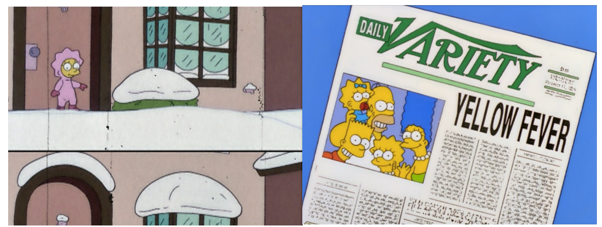
Figure 5 and 6: Mock home footage of baby Lisa, and a mock front page of Variety praising the Simpsons family. "Behind the Laughter" (Mark Kirkland, 2000). The Simpsons: The Eleventh Season . 20th Century Fox Home Entertainment. 2008. Screenshot.

As Hight notes, " The Simpsons ' regular complex narrative style arguably incorporates a number of mockumentary elements, including mock news programmes, educational and public relations films and occasional clip programmes presented by 'actor Troy McClure' (Phil Hartman)" ( Television Mockumentary 190). Yet, the two episodes here considered differ from the rest in virtue of their being entirely constructed as documentaries.