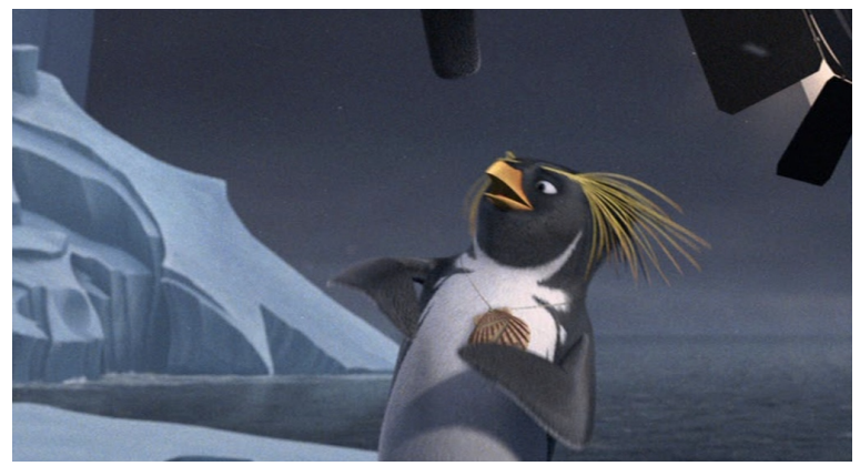
Figure 10: Boom and light equipment left in the frame during the initial interview to Cody. Surf's Up. Sony Pictures Home Entertainment. 2007. Screenshot.

or in credible live-action mockumentaries their occurrence can be justified by the aforementioned necessity of alerting the viewer to the films' fictionality, in these animated texts they would be redundant, if used just for such purpose. Indeed, as seen earlier, the presence of animation alone already prevents viewers from putting in place a "documentarizing reading" (Odin 229). However, if we consider Surf's Up , we will see that here such clues are widely deployed throughout the entire film. Not only a boom or part of the lighting equipment often appear in the frame, highlighting the film's staged nature, but we can also find scenes that the camera following Cody could not have ostensibly caught, the most evident of which is the one showing the thoughts crossing the mind of the young penguin when starting the competition—indeed, needless to say, no live-action camera can yet chronicle mental processes. Moreover, there are sequences in which a character acknowledges the presence of the crew's members by posing them a question or by throwing objects in the direction of the camera lens. This occurs for example when Big Z hurls some shells at the camera in order to discourage the crew from filming him.