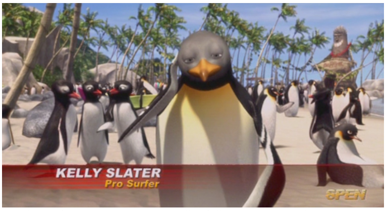
Figure 1: Mock-news feed of the Big Z Memorial Surf Contest replicating the aesthetics of ESPN sport events' coverage. Surf's Up (Ash Brannon and Chris Buck, 2007). Sony Pictures Home Entertainment. 2007. Screenshot.

legendary surf championship: the Big Z Memorial Surf Contest. Thereby, exactly as it would happen in a live-action mockumentary, the film was endowed with the semblance of a factual product by means of a vast array of those codes and conventions which we are so accustomed to seeing used in a documentary that they "have in themselves become part of our everyday common sense understandings" of it (Faking It 17). In particular, taking advantage of a specially developed camera system capable of capturing the motion of a physical video camera, the animators have integrated in the film techniques usually associated to the idea of unmediated reality, such as quick zooms, shaky handheld camerawork and abrupt camera movements (16). Furthermore, the movie includes throughout talking-head interviews complete with captions that inform us about the identity and profession of the interviewees, photographic stills portraying one of the protagonists, and news feeds of the surf contest created in the fashion of the U.S. television channel ESPN's sport events coverage. Additionally, Surf's Up also showcases mock-archival footage crafted so as to give the impression that the various excerpts pertain to different decades. In order to do so, once created, the shots were digitally bleached out and/or aged "with CG dust, scratches and penguin feathers" (Robertson 14).