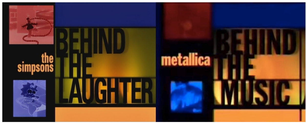
Figure 7 and 8: "Behind the Laughter"'s graphic package compared to that of the series Behind the Music. The Simpson . 20th Century Fox Home Entertainment. 2008. "Metallica." Behind the Music . VH1, 1998. Screenshots.

In particular, the first, which was originally aired in 2000 as season finale of the eleventh series, is modelled on the factual VH1 TV program Behind the Music (1997-2004). 11 Only here, instead of a musician or a band, the Simpsons clan is profiled by documenting the ups and downs of each family member's career, as if these animated characters where real-life actors. It is important to note that, in this case, Matt Groening's team hasn't simply reproduced the generic codes and conventions of a set documentary mode of representation, but it has also deployed the aesthetics of the specific factual series referenced. Indeed, two arrays of veridictive marks are showcased. On the one hand, we find those broadly proper of the "expository mode" (Nichols 31), which is the mode of documentary filmmaking here mimicked, such as a voice-of-God narrator, archival footage, interviews with eyewitnesses and what Colombo would call "exhibits" (50; my translation) that is to say elements which bestow concreteness and relevance to these figures (for example, newspaper front pages providing an account of the family's success, or albums it is pretended they have recorded). On the other hand, throughout the episode aesthetics peculiar to Behind the Music are also reproduced, such as the voice of its regular narrator Jim Forbes, or this factual series' graphic package, which has been mimicked very closely thanks to the help of the VH1 teem itself.