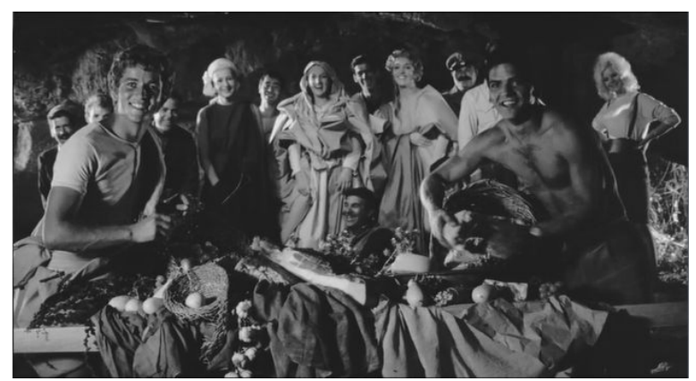
Figures 11 and 12: Stracci underground, and the tableaux vivant actors reformed underground. La ricotta . Eureka Entertainment, 2012. Screenshot.

Finally, in the closing scene of the film, in an exchange of position with the arthistorical, iconographical Christ figure, who has been displaced from the cross, Stracci is raised aloft, with the cruciform structure returning to its iconographical position. Thus the reversal is complete: the Christ figure is deposed and substituted by Stracci, who, suffering from the effects of consuming such a vast amount of food, dies on the cross. Deposed alongside the Christological are Pasolini's excessive art-historical tendencies and the erotic cathexis of the crucifixion, with the concomitant elevation of the corporeal, the comic and carnivalesque, all representative of immanence and earth-dwelling.