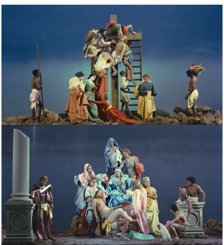
Figures 3 and 4: Rosso Fiorentino tableau vivant (top) and Pontormo tableau vivant (bottom). La ricotta (Pier Paolo Pasolini, 1963). Ro. Go. Pa. G. Eureka Entertainment, 2012. Screenshot.

scenes, underlining Gotthold Lessing's view of tableau vivant or history painting, a style of painting prevalent from the mid-sixteenth to mid-eighteenth century, as portraying the "pregnant" moment, "the one most suggestive of what has gone before and what is to follow", when all hangs in the balance (92). In the tableaux vivants of the deposition, Christ's body is depicted in its post-crucifixion state. However, Pasolini subverts the drama of Lessing's "what has gone before and what is to follow", in that the real death on the cross only occurs at the end of the film, after the tableau vivant reenactments are shown. In doing so, he emphasises the abstracted nature of the paintings, whose depiction of the Passion narrative is so familiar to the viewer that the pregnant moment is virtually negated. Instead Pasolini reveals through these reenactments a prophecy of Stracci's death. Thus, it is Stracci's life that hangs in the balance in the short film, although both the film crew as diegetic spectators and we, the nondiegetic spectators, are too caught up with the comedy of Stracci's predicament to realise the tragic aspect of the narrative—the full import of which only becomes clear in the final moments of the film.