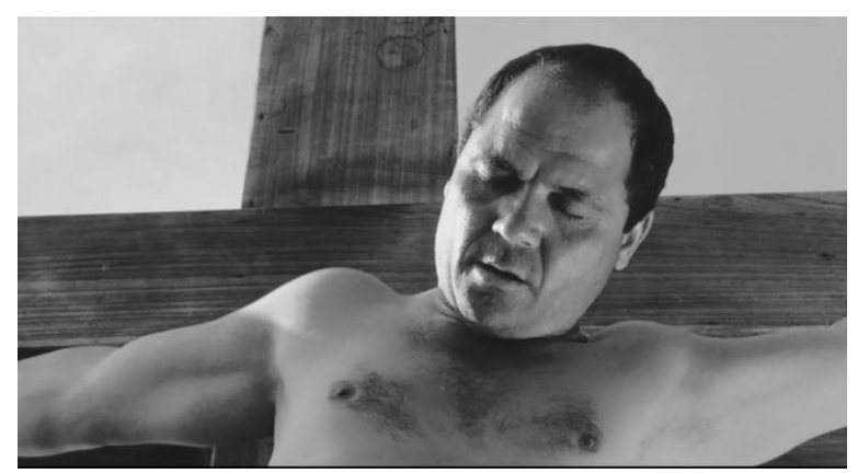
Figure 13: Stracci dies on the cross. La ricotta. Eureka Entertainment, 2012. Screenshot.

Finally, in the closing scene of the film, in an exchange of position with the arthistorical, iconographical Christ figure, who has been displaced from the cross, Stracci is raised aloft, with the cruciform structure returning to its iconographical position. Thus the reversal is complete: the Christ figure is deposed and substituted by Stracci, who, suffering from the effects of consuming such a vast amount of food, dies on the cross. Deposed alongside the Christological are Pasolini's excessive art-historical tendencies and the erotic cathexis of the crucifixion, with the concomitant elevation of the corporeal, the comic and carnivalesque, all representative of immanence and earth-dwelling.