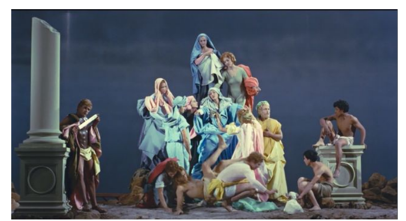
Figure 10: Collapse of the Pontormo tableau vivant. La ricotta. Eureka Entertainment, 2012. Screenshot.

Pasolini's deposition of the iconographical Christ figure in deference to Stracci's transimmanence is also reflected in a devaluation of the significance of the structure of the cross, which only fully comes into view in the final scene. Indeed, in Pontormo's original painting and in its reenactment in La ricotta , the cross is wholly absent, while in the original and reenactment of Rosso Fiorentino's deposition, the cross is so covered with the bodies of the deposition group as to be barely visible. This lack of a supporting structure in the deposition scene, with the exception of the other human figures that attempt to keep Christ's body raised above the ground, prioritises a descendant vector, which may be interpreted as representing the deposition of the divine and the art historical. In this regard, it should be noted that, while the deposition refers to the physical descent of Christ's body from the cross, a synonym for deposition is deconsecration. Thus the concept of desacralising is inherent in the act of deposition.