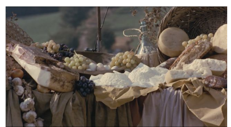
Figure 5: Banqueting table. La ricotta. Eureka Entertainment, 2012. Screenshot.

While the carnivalesque in La ricotta is manifested through elements such as the communal laughing and joking of the film crew, Stracci dressing in women's clothes to steal a second lunch and a female extra performing a striptease to frustrate him while he is tied to the cross on the ground, the parallel between the sacred and the carnivalesque is particularly evident in the form of the banquet in the film. A recurrent motif is the trestle table laden with food, reminiscent of a Dutch seventeenth-century still-life painting. Although no specific memento mori is present, as is conventional in such paintings, the array of ripe fruit may be read as a subtle vanitas, indicating the transience of life. Moreover, at one point in the film, Stracci indulges in his own subterranean banquet without table, cloth or utensils, but consuming the same prodigious amount of food as is displayed on the more formal table. Both versions of the banquet depicted in the film can be viewed as reflections of one of the focal points of the film: Stracci's excessive, gargantuan appetite. In his parodic version of the Last Supper, Stracci finally succeeds in satiating his hunger. While doing so, he is surrounded by the actors and film crew who throw food to him from the banquet table, reflecting the chaos and disorder of the carnivalesque.