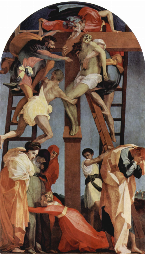
Figure 1 (left): Jacopo Pontormo, Deposition (1523–1525). Chiesa di Santa Felicita, Florence. Figure 2 (right): Rosso Fiorentino, Carriage to the Sepulchre . (1521). Pinacoteca Comunale di Volterra.

In addition to the bracketing effect inherent in the polarities of black and white versus colour and movement versus stasis, the tableaux vivants scenes are filmed in a studio, whereas all other scenes are filmed on location in the hills on the outskirts of Rome, with Pasolini's beloved borgate (slums) visible in the distance. The mise en scène of the tableaux vivants , in contrast, is highly abstracted, as the reenactments take place against a uniform blue screen. At one stage, this sense of disjunction is heightened even further in a shot-reverse-shot in which the diegetic film director, sitting in his director's chair perched on the Roman hillside, gives instructions to the studio-bound actors in the tableau vivant .