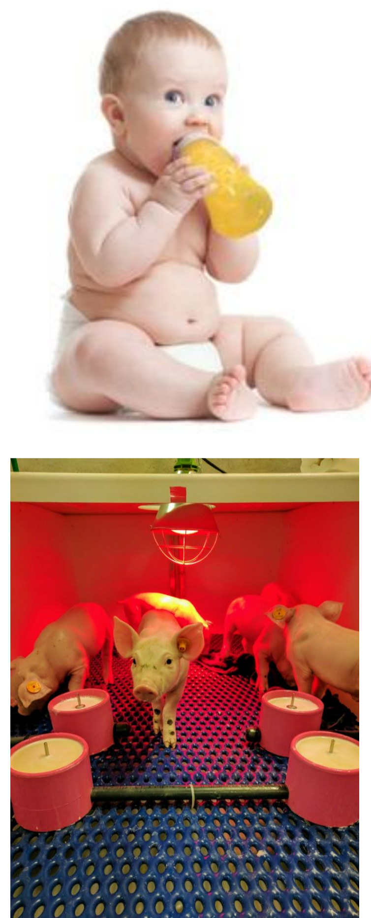
Figure 1: Ontogeny of GFR of growing piglets and children.

Development of appropriate preclinical juvenile animal models is pivotal for proper conduct of paediatric clinical trials. This was also recognized by the European Medicine Agency (EMA) in the 'Guideline on the need for non-clinical testing in juvenile animals of pharmaceuticals for paediatric indications'. Traditional animal species such as rodents, dogs and non-human primates are not always appropriate models to study age-related pharmacokinetic (PK), pharmacodynamic (PD) and safety parameters. Therefore, alternative models such as the conventional piglet might offer advantages for paediatric drug development. The adult pig has been demonstrated to be a suitable animal model for adult preclinical studies. However, studies investigating the suitability of a paediatric pig model are still lacking. The aim of this work was to evaluate if the conventional piglet is a suitable juvenile animal model for preclinical paediatric studies of renally excreted and/or acting drugs using desmopressin as case.