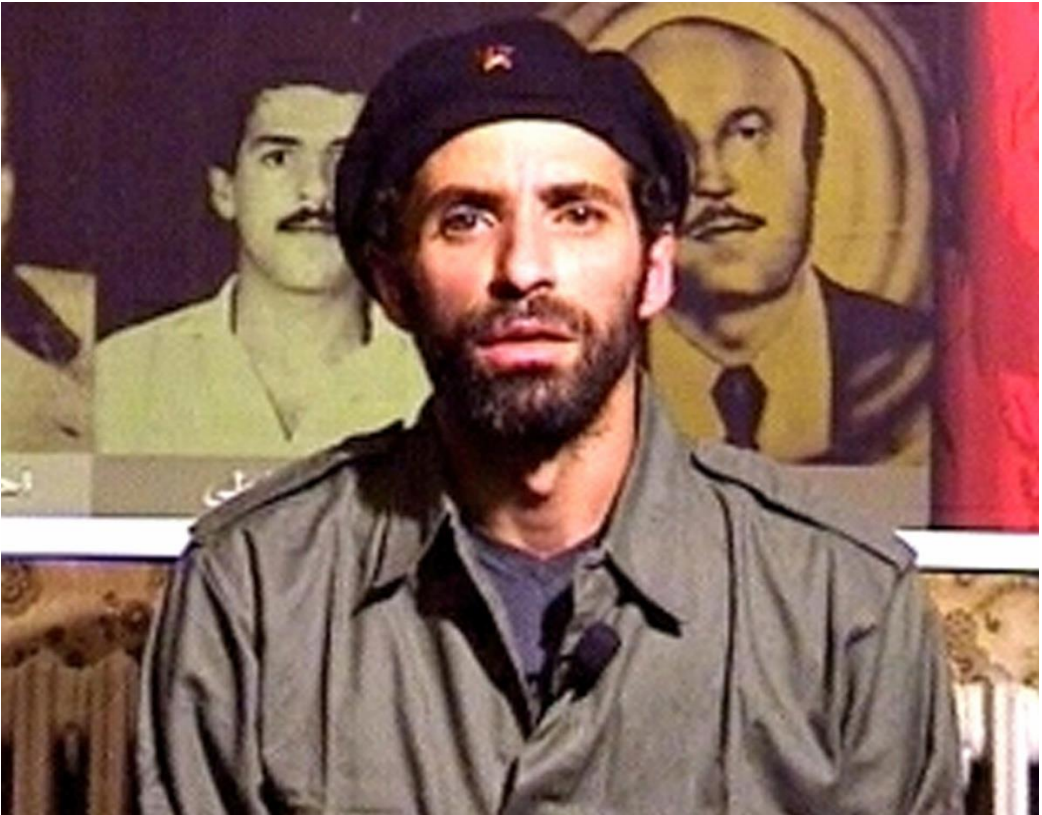
Figure 3: Still from Three Posters

The first part of the performance unfolds one of three layers of the suicide bomber. Next to being a martyr (sacrificing his life for the greater good), and next to being a politician (the suicide bomber makes a violent, paramilitary statement, but also a political one), the suicide bomber is also an actor, as the first part explicitly portrays him rehearsing different takes of his testimony. As an actor, he almost narcissistically looks for the ideal final image of himself; the best version of his testimony, in which his decisiveness and eloquence are the strongest and his hesitation is the smallest. After all, the martyr video is the ultimate image of the suicide bomber; the final trace of the martyr ever having been there . Thinking of the suicide bomber as an actor, Mroué and Khoury reveal an interesting and oftentimes neglected aspect of martyrdom, namely the fact that it is a rehearsed performance in which a human acts as a hero (as the alleged heroic act has not been acted out yet). In one stroke, they also criticise these images of martyrdom, exposing these videos as fabricated, edited footage used as an ideological weapon.