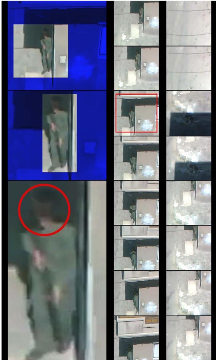
Figure 1: Screenshot from The Pixelated Revolution

looks for the sniper again, and when he appears inside the frame, we see him aiming the rifle at the camera and hear a shot. The camera falls to the floor, and now films the greyish ceiling of the apartment. 6