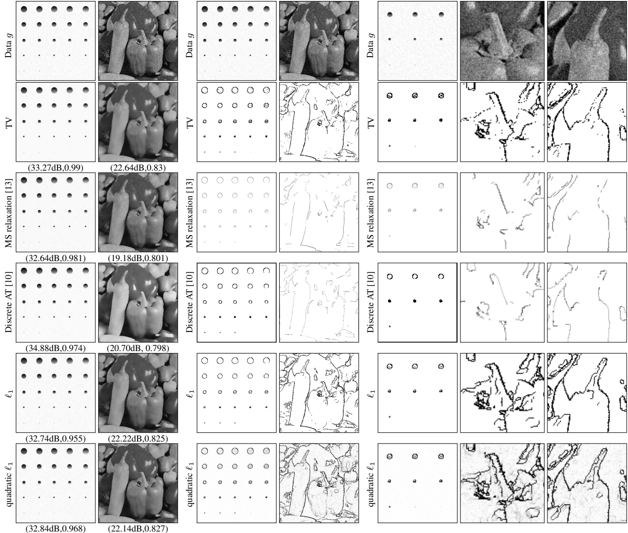
Fig. 2: Comparison of the proposed method with some state-of-the-art segmentation and denoising methods for two different images of sizes 128^2 and 256^2 . Left: denoising results ( u ) with (SNR,SSIM) values, middle: contours (extracted from a threshold over Du for TV, and from v for the other methods), right: zoom on the contours.

this method in the comparison. The proposed model is much faster than [10] for both choices of \mathcal{S} , in particular with the quadratic \ell_1 -penalization, for similar denoising and segmentation performances.