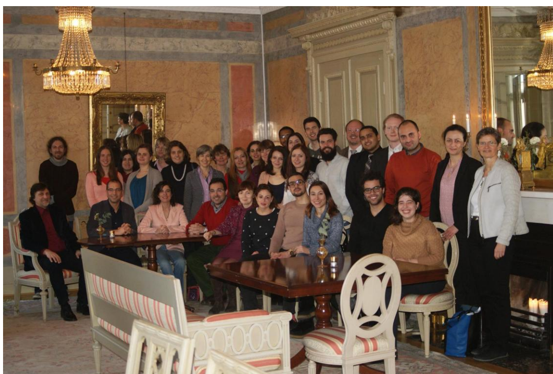
Participants at the SELECTA Mid-Term Review Meeting (Goteborg, Sweden, December 5-9 th 2016)

tunable structure (amorphous, nanocrystalline), morphology (dense, nanoporous) and geometry (films, micropillars, nanowires), to meet specific technological demands (high wear/corrosion resistance, superior magnetic properties or hydrophobicity). Several disciplines (Physics, Electrochemistry, Engineering, Environmental Sciences, Biology and Robotics) converge together to provide a holistic approach to accomplish the SELECTA goals. World-class research is combined with unique training opportunities in soft skills, such as career planning, dissemination, intellectual property rights, entrepreneurship or management. The Network aims to provide highly-qualified specialists able to face future professional challenges in either Academia or Industry in an independent manner.