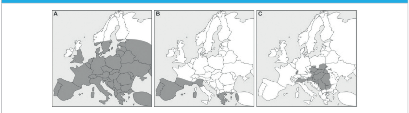
Figure 1: Distribution of the three main maize pests in Europe.

A: European corn borer ( Ostrinia nubilalis ); B: Mediterranean corn borer ( Sesamia nonagrioides ); C: Western corn rootworm ( Diabrotica virgifera virgifera ). Note that the area where the pest species cause damage to crops is generally smaller than the distributions of the species.