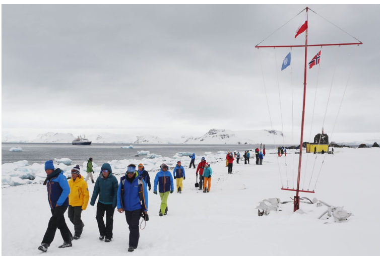
Fig. 2 Tourists visiting Arctowski Station in the austral summer.

The abundance of propagules of alien species was found to be pathway dependent (Houghton et al. 2016). The majority of tourist ships depart from Ushuaia or Punta Arenas and participate in multi-site tours. The sequence of sites visited over the short time period is from warmer areas of higher biodiversity (Tierra del Fuego and sub-Antarctic islands) to the cooler highly pristine sites in Maritime Antarctica and the Antarctic continent (Chwedorzewska 2009). For most ships, the Polish Station is the first place visited after departure from South America. Furthermore, the same ships commonly visit high-latitude polar regions in the Northern Hemisphere within 6 months of departing for Antarctica (Chwedorzewska and Korczak 2010). Also the supply ship of the Polish Antarctic Station operates as a tourist ship in the Arctic during the boreal summer (Chwedorzewska 2009). This can increase the probability of introduction of non-native species with pre-adaptations to survive in polar conditions.