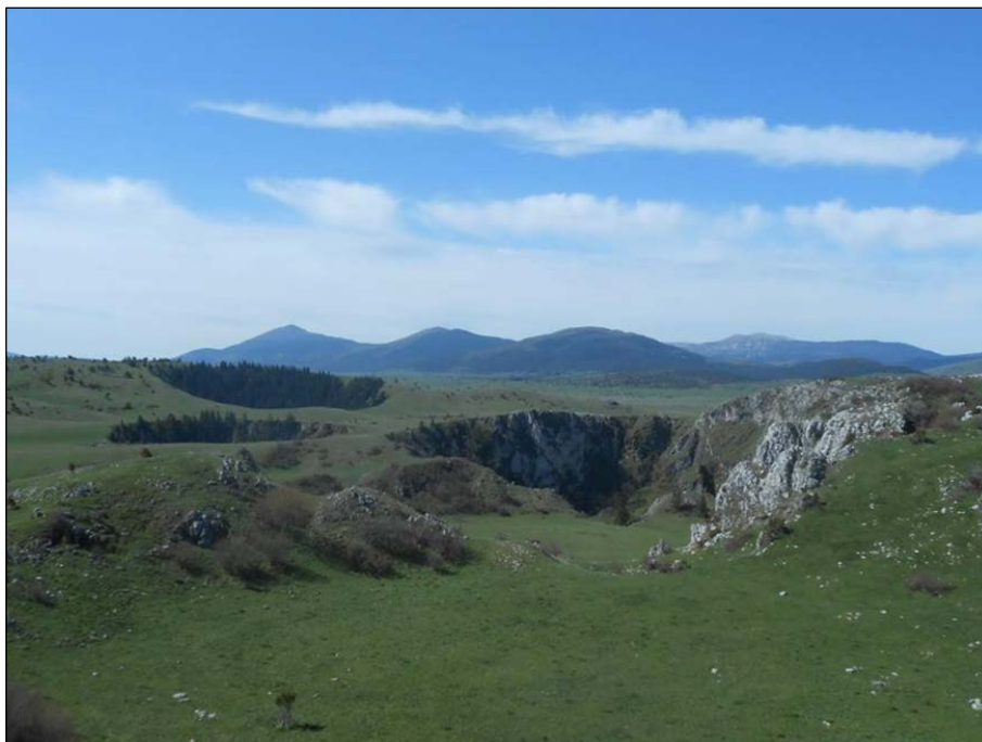
Fig. 3. Locality of Japage.

Largest and the most spectacular sinkholes can be found on the north side of Kupreško polje, on the locality known as Japage, next to village Rastičevo. Five large sinkholes (Topolovica, Mrnjašica, Crljenka, Kotlić and Japažica) are found here. Some 50 meters high rocky uplift is located between them, and it can serve as fantastic viewpoint to significant part of Kupreško polje and its phenomena. Diameters of these gigantic sinkholes vary between 140 and 320 meters, while their depth varies between 32 and 112 meters (Mijoč 2011; Stepišnik 2014). Sinkholes bottoms are covered with forest vegetation. Locality of Japage is extremely rare karst phenomenon, so it is very interesting to geomorphological and geological explorers, but it has not been done much on its tourism promotion for more diverse types of tourists so far.