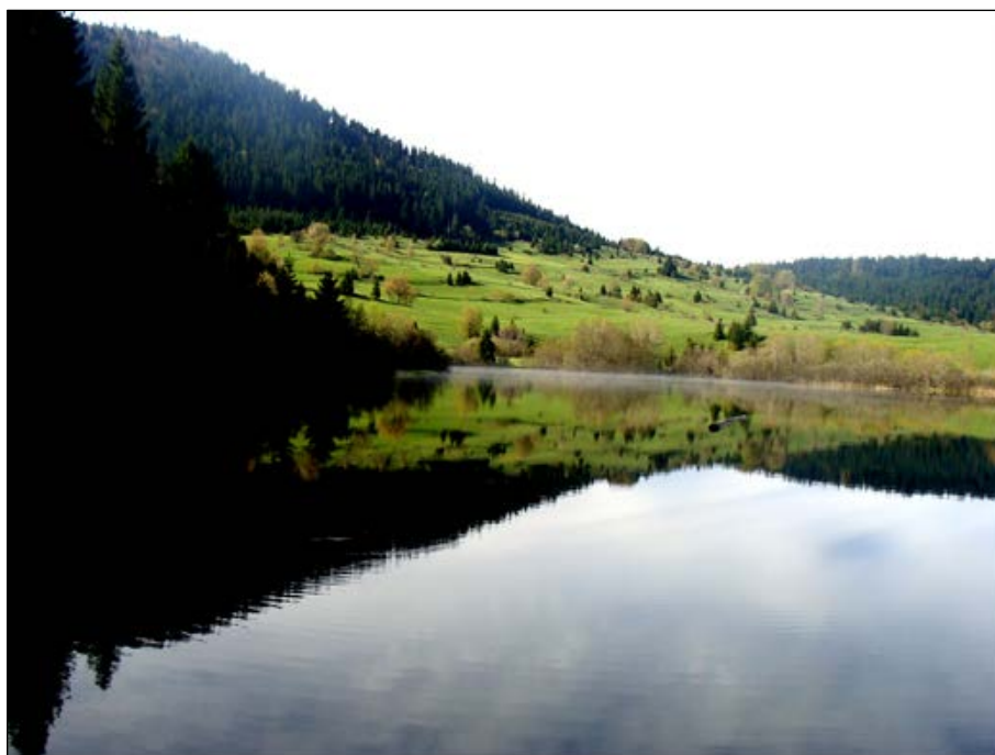
Fig. 4. Kukavice Lake.

Just north of Japage, in its immediate proximity, Rastičevo Lake is located. It is one of three natural lakes in Kupreško polje. Its length is 180 meters, width is 130 meters, and maximum depth is 10 meters. Some alternative names, like Blagaj Lake, Vilino Lake, or Crno Oko, are also in use. Two other lakes are located much more to the south, next to eastern margin of the field. These are Kukavice Lake (near the village of Kukavice) and Turjača Lake (next to village Zanaglina). Both have similar dimensions as the Rastičevo Lake. Tourism potential of these lakes is insignificantly valorized so far, partly because tourism promotion of Kupres was not focused on them. On the other hand, if it comes to higher degree of tourism exploitation of these lakes, it is necessary to consider ecological issues and preservation of original natural ambient. Lakes, however, are not the only hydrological phenomena that can be used for tourism purposes.