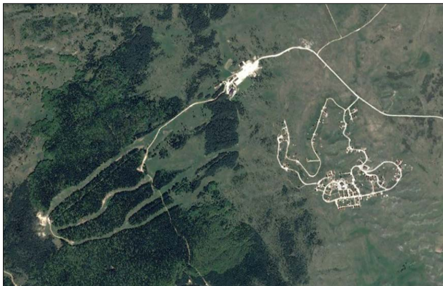
Fig. 2. Ski resort of Čajuša.

resort is 350 meters, which is less than in the case of Stožer-Vrana, where the difference is 415 meters. There are more than 200 cottages at the foothills of Čajuša. Hotel Ski Adria is also located here, while the rest of hotels are in the urban center. Čajuša is 8 kilometers away from Kupres. According to Hamad et al. (2010), Kupres resorts occupy the position of marker niches.