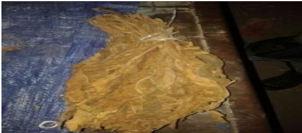
Figure 1.2 Sun-dried toombak