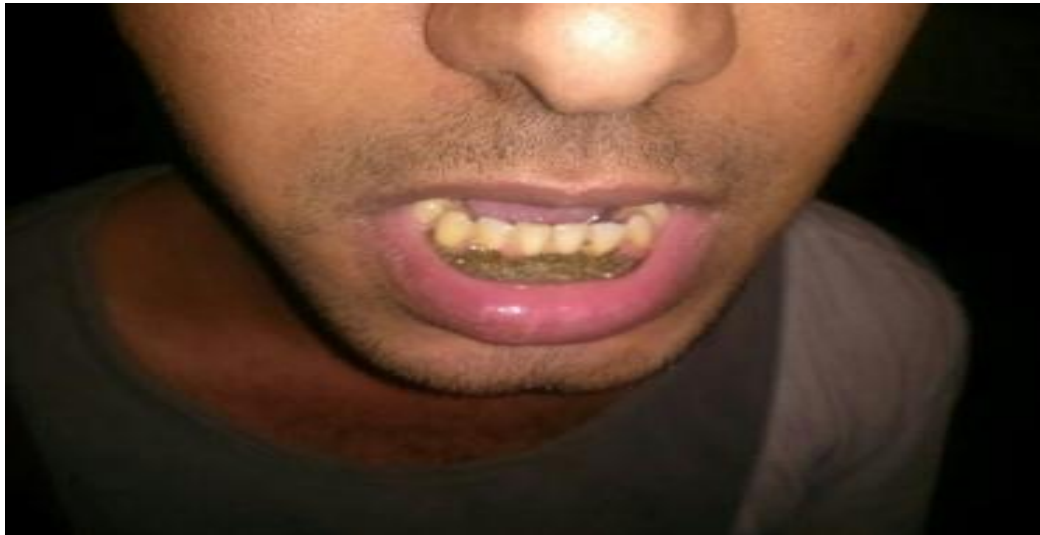
Figure 1.3 Shammah in the lower labial vestibule of the oral cavity