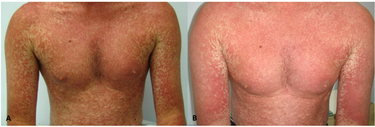
Figure 10: Comparative photographs showing progression of cutaneous disease from 2010 (A) to 2012 (B)