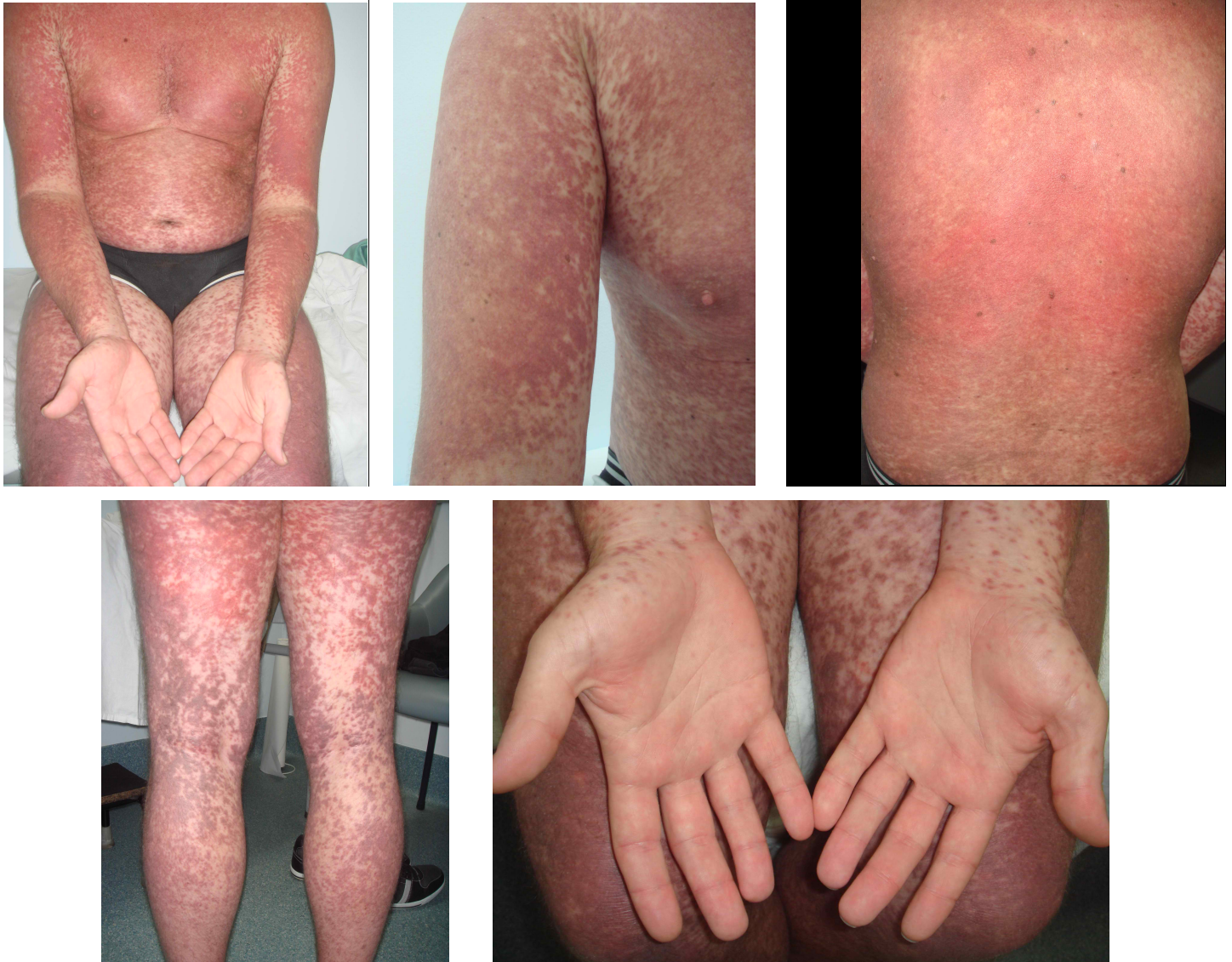
Figure 1 – 5: Widespread urticaria pigmentosa with confluent urticated erythematous maculopapules. There is obvious sparing of palmar surface

On examination, there were multiple monomorphic red-brown macules and papules, which were most numerous on his trunk and proximal extremities and noticeably spared his face, palms, and soles (Figure 1-5). Darier's sign was negative. Abdominal examination was unremarkable and there was no palpable peripheral lymphadenopathy.