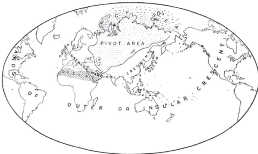
Figure 1: Halford J. Mackinder's Heartland Theory map, as published in 1904