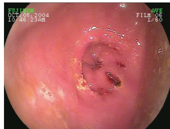
Fig 3: Day 7 of treatment. The pylorus can be seen and appears severely ulcerated.

Persimmon fruit contains soluble tannins such as shibuol around the calyx and under the skin. The tannins decline in concentration as environmental temperatures decrease during the winter. Once ingested, the tannic acid from unripe fruit binds proteins such as digestive enzymes and glycoproteins. In the presence of dilute hydrochloric acid in the stomach, the tannic acid polymerises forming a coagulum that includes cellulose, hemicellulose and proteins (Holloway et al. 1980). This plant concretion is called a phytobezoar, and more exactly a diospyrobezoar because it originates from persimmons. The persimmon seeds become cemented in the phytobezoar causing mechanical damage and abrasion of the mucosal lining of the stomach. Persimmon phytobezoars are the most common cause of gastric impactions in man. Risk factors are ingestion of unpeeled fruits and a history of gastric surgery (Benharroch et al. 1993). The diagnosis of a persimmon diospyrobezoar in this pony was based on the exposure to persimmons in the autumn, presence of fermented and orange-tinged reflux, colic signs, endoscopic identification of persimmon seeds in the mass and in the feces described in the literature (Honnas and Schumacher 1985; Morgan 1994; Cummings et al. 1997; Kellam et al. 2000).