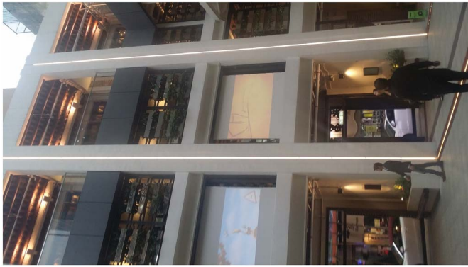
Fig. 1. Comix Home Base, located in the Green House in Wanchai.