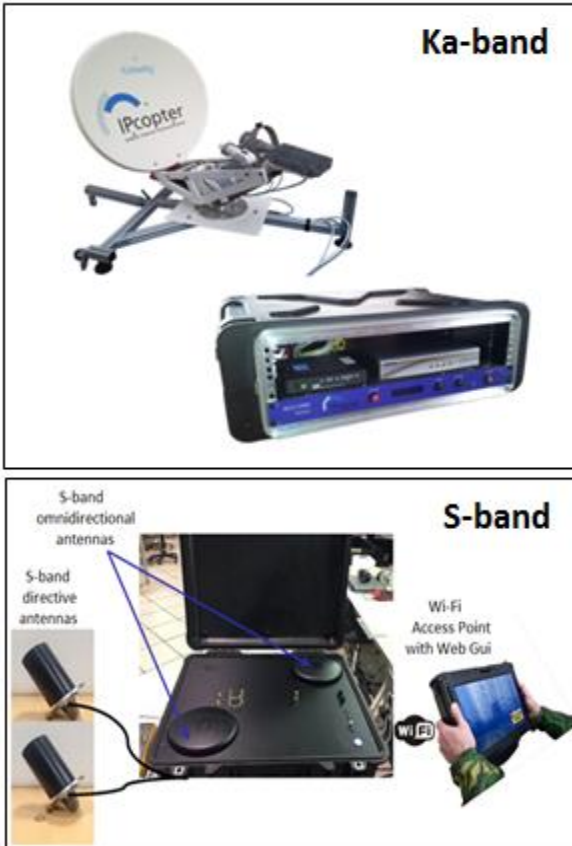
Figure 5. Ka-band Backhauling (Antenna and Suitcase Unit) and S-band Messaging (Modem, Wi-Fi and Antennas) Satellite Equipment.

The Ka-band backhauling makes use of the Tooway system of Eutelsat, that provides satellite broadband services over all Europe via the 82 spots of the high-throughput geostationary satellite KA-SAT, positioned at 9° East. The ground segment is composed of 8 terrestrial gateways, plus 2 for back-up, deployed in different regions and inter-connected in a fiber ring for maximum reliability. This backhauling solution provides a tried and tested, stable, and reliable platform able to perform any IP communication, from voice to data, from any location in Europe as long as there is line of sight from the terminal to the satellite.