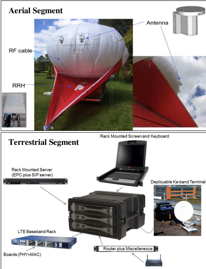
Figure 3. Aerial-eNodeB implementation: aerial segment (RRH and antenna) and terrestrial segment (EPC, LTE base band Ka-band equipment) pictures during validation phase.

An important component of the aerial segment is the Helikite, which is a helium inflatable kite that relies on lighter-than-air principles to achieve buoyancy, with increased lift and stability thanks to its kite profile and the use of a tether (which is moored to the terrestrial segment). Helikites aerostats are reliable in high winds, heavy rainfall or very dusty conditions. The ABSOLUTE system use moderate sized helikites of 34\text{m}^3 , highly mobile, simple/fast to set up, and only require a few days training for the operators. This helikite is 6.5 meters long, 5 meters wide, and has a net helium lift in no wind, in dry conditions, of 14 kilograms. Note that rainfall, snow, sleet etc. will reduce the lift by 3 kilograms or so. Therefore, this leaves about 10kg for maximum payload, including RRH, fiber-optic, batteries, waterproof cases, etc.