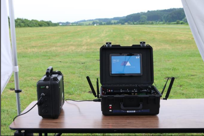
Figure 4. Portable land mobile unit equipment (PLMU, on the right) and its battery (on the left) during validation phase.

The PLMU corresponds to the terrestrial communication segment of the ABSOLUTE architecture. This unit is deployed on the ground and therefore offers a smaller coverage compared to that reached with the AeNB. However, it provides additional wireless communication technologies and it is also highly modular for answering different users' needs. The PLMU has been implemented as a complete communication system embedded into a rugged suitcase as shown in Figure 4. It is composed of several components as listed in Table 1. The entire system can be powered either by a regular power outlet or by a battery pack providing up to several days of autonomy, depending on the battery capacity and the components being in use. The PLMU is modular and easily adaptable to the requirements of each specific emergency situation by using only the required communication technologies, which are switching on/off using the relay blocks module. External devices can be plugged to the PLMU for extending its capabilities, e.g. a satellite system for enabling satellite backhauling.