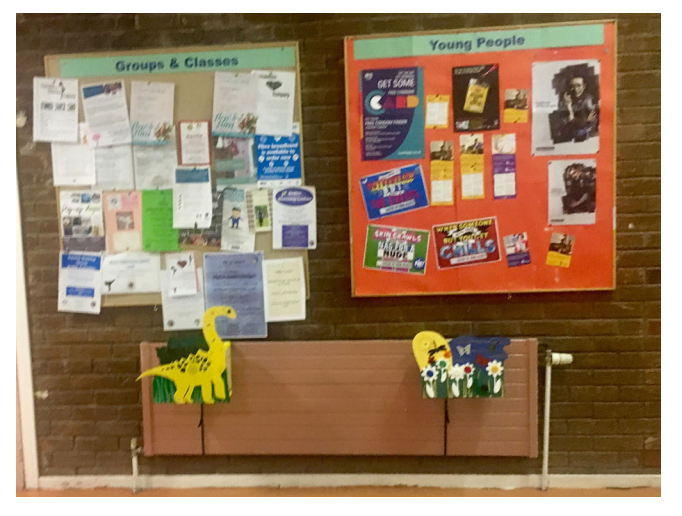
Figure 4. Prototypes deployed in Ardler's community centre.

Across the day, the most significant challenge was the lack of people on the street who could interact with the prototypes. Even during a school holiday, the streets were relatively quiet, which made it difficult to conduct observations. However, towards the end of the day, they placed the prototypes on railings outside the community centre entrance. This was one of the busiest locations in the neighbourhood, where people frequently waited to meet other people, or passed on the way in and out of the centre. In this location, passers-by would often be attracted by the