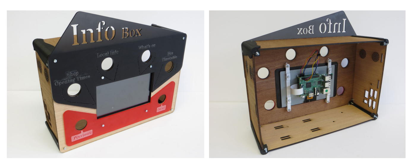
Figure 3. Example of the Inventor Kit used to build the Info Box prototype, before addition of buttons.

overcome that barrier and take the next step towards realworld use and how other neighbourhoods might be able to replicate these designs. To explore this, we developed a set of kits to with two broad goals: firstly, to understand the challenges that they might face when constructing physical civic technologies from kits, and secondly how well such kits might enable them to devise new civic technologies or customise devices for their local area.