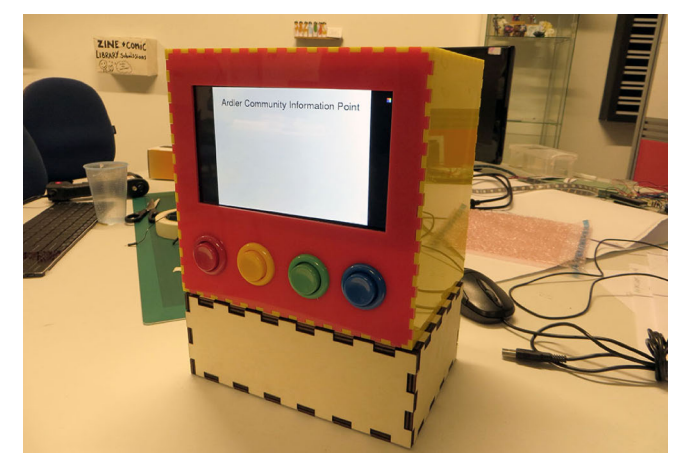
Figure 1. InfoBox prototype after the third Inventor Day.

One of the main outcomes of the Inventor Days was the insights generated into the neighbourhood. Focusing on learning about Ardler was the starting point for identifying issues and inspiring ideas, which were developed across the remainder of the first day. This occurred firstly through casual gatherings over lunch and then through the afternoon's activities, where participants distilled their observations from the morning into a series of challenges and opportunities, then ultimately a set of ideas that could be taken forward into the second event.