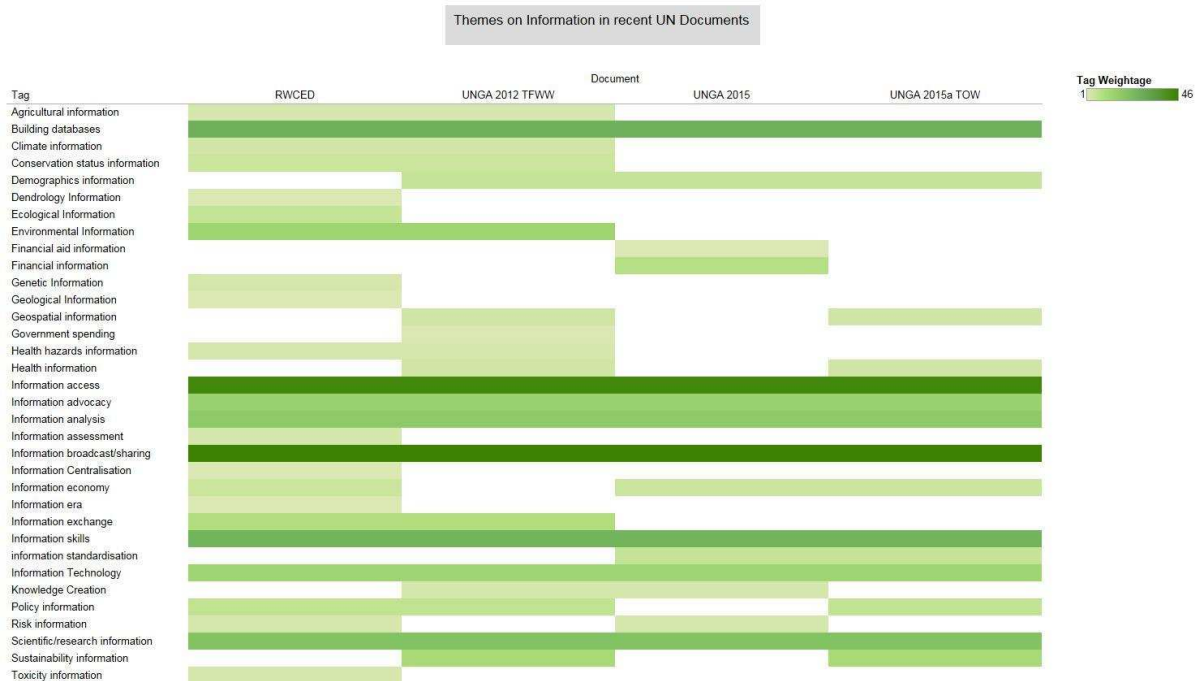
Figure 1: Thematic map of information appearing in four key UN documents

following sentences, in order to understand the theme and create the tag accordingly. Thus these tags show the different information related themes appearing in the leading UN documents on sustainable development.