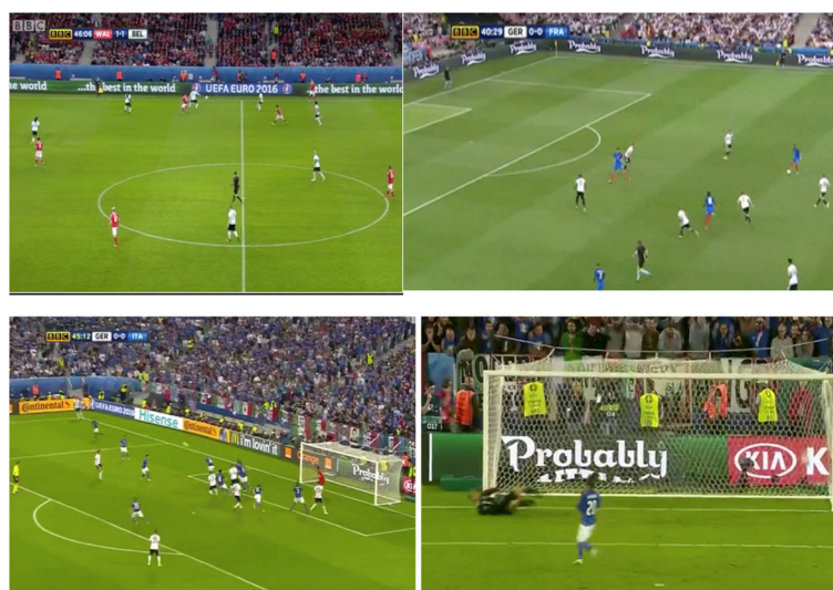
Fig. 1 Screenshots of alibi appearances

The anticipated TV audience for UEFA Euro 2016 in 230 territories around the world was high: 150 million spectators were expected to follow each game live [17]. The demographics of that audience have not been made public at the time of writing but if the international audience profile for the UEFA Euro 2016 follows that of the UK then an estimated 12.9 million children were exposed to Carlsberg billboards (based on 8.6% of the TV audience being aged 17 or under). An average of 829,000 children were exposed to Carlsberg alibi branding in the UK; if TV viewing figures in France mirror those of the Brazil World Cup, this translates to an average of 387,000 children exposed in each game. This exposure has occurred despite Loi Evin prohibition of the targeting of minors. The explanation for the much lower alibi content in the France versus Iceland than the other