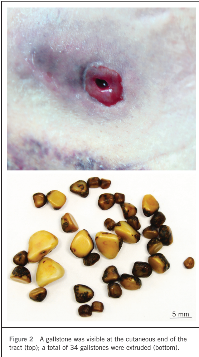
Figure 2 A gallstone was visible at the cutaneous end of the tract (top); a total of 34 gallstones were extruded (bottom).

collections or stones. She was ultimately discharged 4 days after readmission and continues to be well.