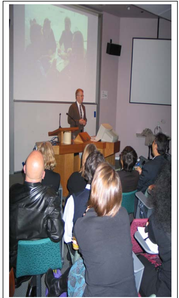
Public Lecture held Wednesday 23 rd September 2009. 'A Science of Connectedness'