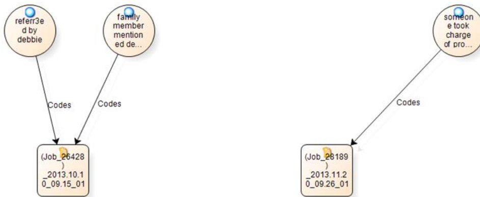
Figure 2 Conceptual model for no treatment group and support received