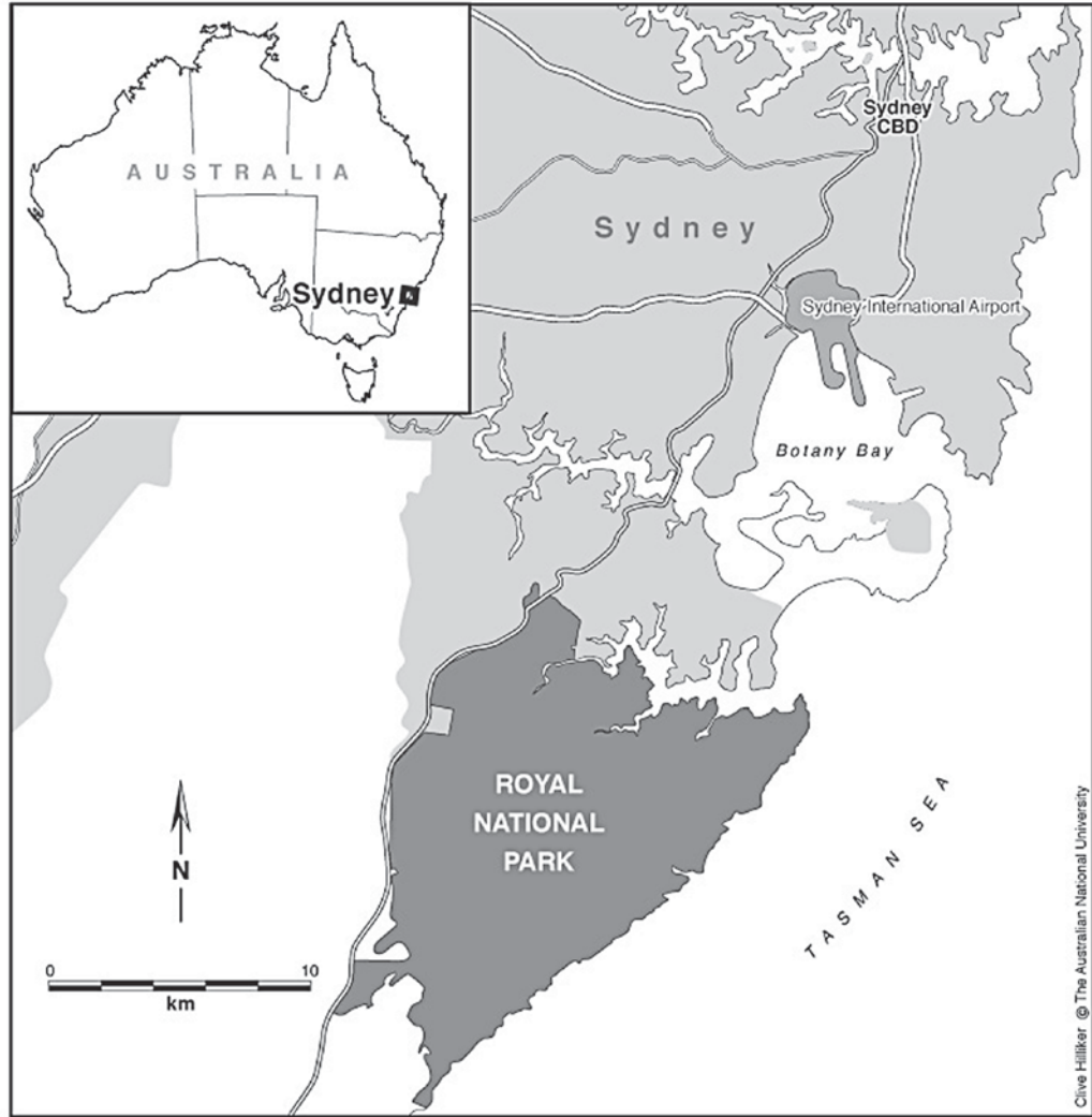
Location of Royal National Park, Australia. (Map: Clive Hilliker).