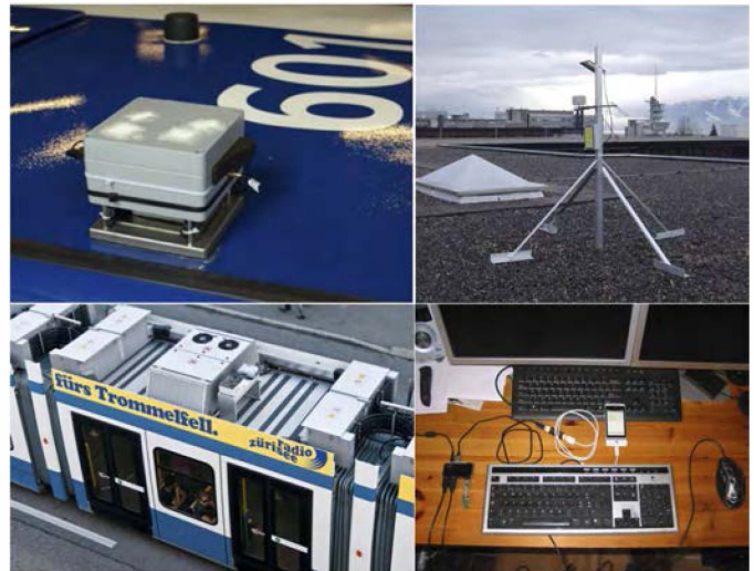
Fig. 1. Air quality sensors that could be used in community sensing. Top left: on top of a bus; bottom left: on top of a tram; top right: attached to a solar-powered weather station on a building; and bottom right: attached to a smartphone.

We are involved in a project that explores community sensing for measuring air quality using both fixed and mobile sensors. Examples are shown in Figure 1. Initial experiments with such sensors suggests that air quality varies significantly