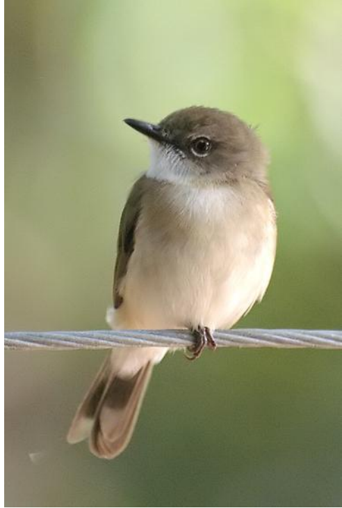
Host and parasite: Large-billed Gerygone (right), and Little Bronze-Cuckoo (below). (Trevor Collins)