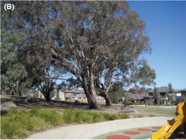
Figure 1 (A) Example of a typical urban park with a large tree (Burrin-juck Crescent Neighborhood Park, Duffy, Canberra, Australia). (B) Example of planned landscaping separating children's play area (foreground) and large trees (Heritage Park, Forde, Canberra, Australia).

there are several categories of urban parkland, ranging from large formally managed town parks to informal district parks, small neighborhood parks, pedestrian parkland and laneways, and informal-use sporting fields (ACT Government 2006). We chose to focus on neighborhood parks, which are typically used for recreation and often include playground facilities (Figure 1A). Neighborhood parks are located in residential areas, are usually 0.25-2 ha in area, and are spaced so that every dwelling is generally within 400 m of a park (ACT Government 2006). As such, these parks may provide a continuum of wildlife habitat throughout urban areas, and their appropriate management is important for urban conservation. We identified neighborhood parks that were between 0.5 ha and 2 ha, contained native trees of the genus Eucalyptus, were >500 m from other parks, >250 m from nature reserves, and in suburbs where the median residential block size was between 200 m<sup>2</sup> and 1,100 m<sup>2</sup>. We placed a 50-m radius (0.8 ha) site at the geographic centroid of