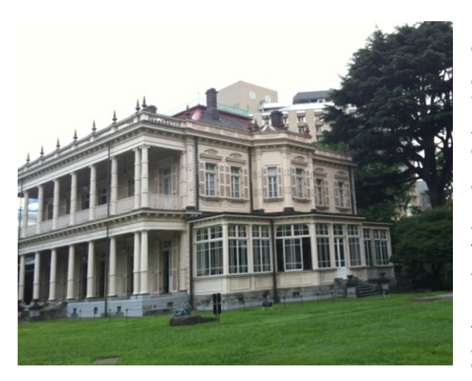
Iwasaki mansion garden

because he remembered repeatedly passing a large neon sign on one corner of the station advertising Morinaga Milk Candy. <sup>11</sup>