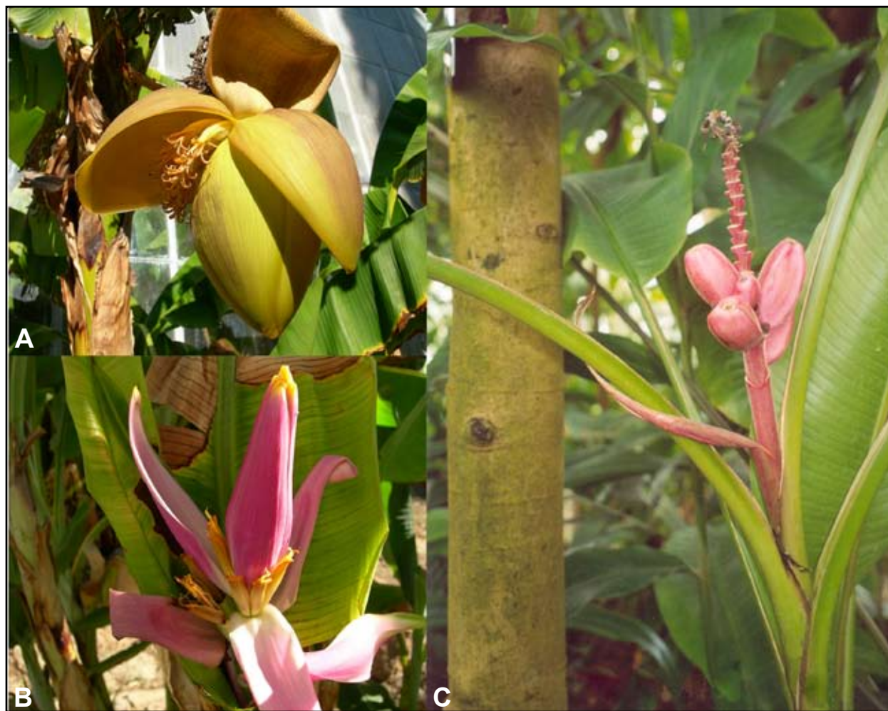
Figure 3. The flowers and fruit of many Musa species are conspicuous and appeal to horticulturally-inclined humans as well as to birds and bats: A. Musa basjoo von Siebold ex Y. Inuma, University of California Botanical Garden, Berkeley; B. Musa ornata Roxb., local nursery, rural central Luzon, Philippines; C. Musa velutina H. Wendl. & Drude, Royal Botanical Gardens, Kew.

Figure 4 (right). In Thai food markets, many parts of Musaceae species are represented: A. Inner core of Musa sp pseudostem is eaten cooked, Chiang Mai; B. Terminal inflorescences are eaten cooked or raw, Chiang Mai; C. Immature fruit of Musa balbisiana Colla eaten as salad, Nong Khai; D. Ripe fruit of Ensete glaucum (Roxb.) Cheesman, also eaten raw, Udon Thani.