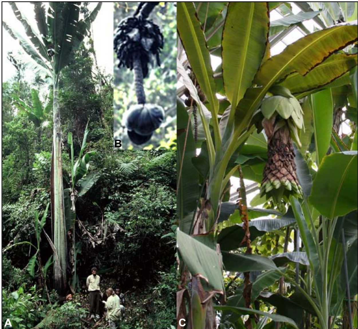
Figure 2. Many Musa species grow to statuesque proportions and dominate the landscape. A, B. The largest is Musa ingens Simmonds, a New Guinea Highlands endemic; C. Ensete glaucum (Roxb.) Cheesman has a wide but scattered distribution from the Eastern Himalayan fringe to New Guinea.

All parts of the plant are useful, including seedy fruit, inflorescence, leaf, pseudostem, corm and rhizome; they furnish food, fodder, medicine, domestic materials and shelter. Plants also have ritual and ceremonial significance. Table 1 lists miscellaneous uses, other than consump-