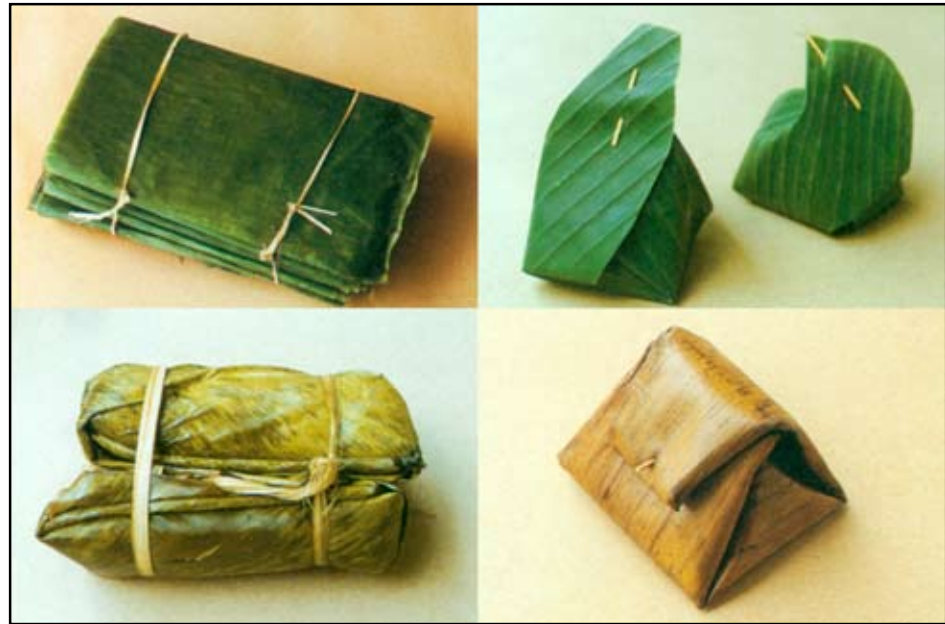
Figure 5. Leaves are widely used for packaging, especially for food, as in these examples of Thai takeaways.

tion of seedless fruit, of Indo-Malesian Musaceae. Given the labyrinthine complexity of literary genres which might refer to bananas, I make no claim that this list is comprehensive in terms of uses or references; it is intended to be exemplary. I have revised the nomenclature, where possible, using the extensive cross-referencing of species names compiled by Constantine (1999-2008). For the sake of brevity, I have somewhat arbitrarily excluded African uses of Musaceae (genus Ensete Horan. is native there, but not genus Musa ), while Polynesia and Micronesia are included because their cultural connec-