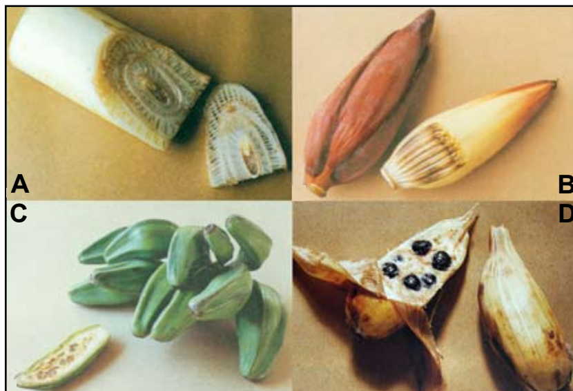
Figure 4 (right). In Thai food markets, many parts of Musaceae species are represented: A. Inner core of Musa sp pseudostem is eaten cooked, Chiang Mai; B. Terminal inflorescences are eaten cooked or raw, Chiang Mai; C. Immature fruit of Musa balbisiana Colla eaten as salad, Nong Khai; D. Ripe fruit of Ensete glaucum (Roxb.) Cheesman, also eaten raw, Udon Thani.