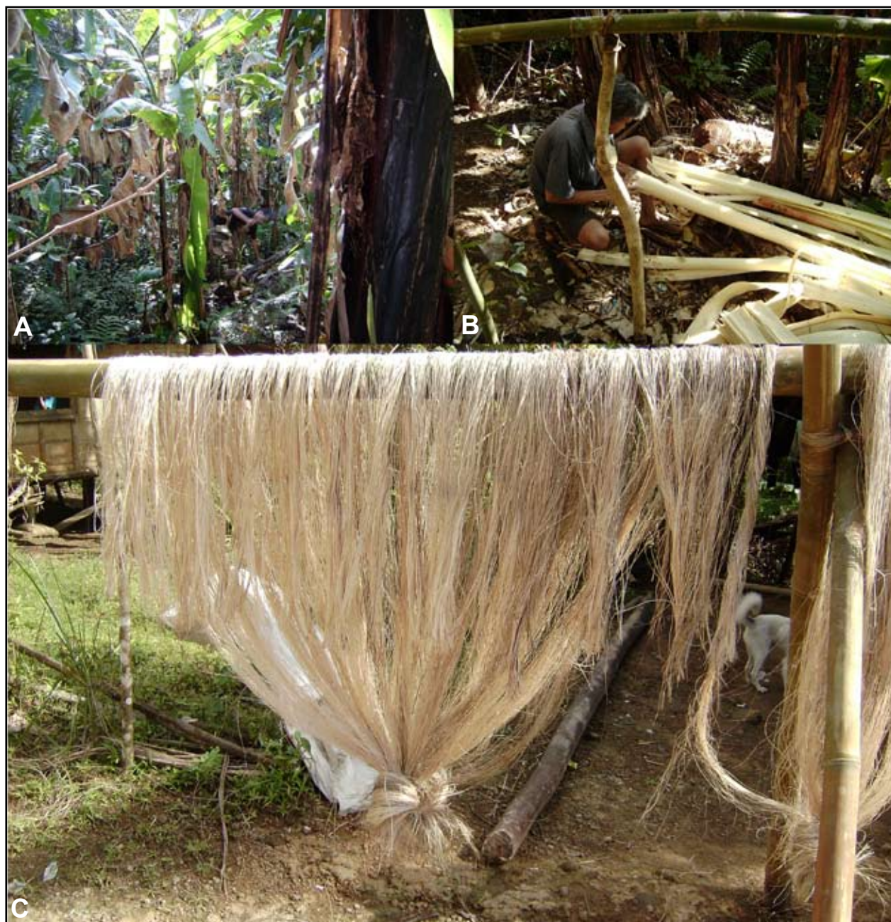
Figure 6. Production of abacá from Musa textilis Née, Aklan, Panay, Philippines: A. Harvesting in a cultivation area; B. Separating layers of pseudostem; C. Drying fiber.

identity (Figure 7). Popularized in Japan by a Japanese craft movement as an emblem of an idealized Okinawan past, the finest bashōfu cloth produced in Okinawa now commands high prices in mainland Japan — more than US$20,000 for a kimono length. The plant is not Musa basjoo von Siebold ex Y. linuma as is commonly claimed (though that species does produce fiber), but Musa balbiana Colla (Hendrickx 2007, Stinchecum 2007).