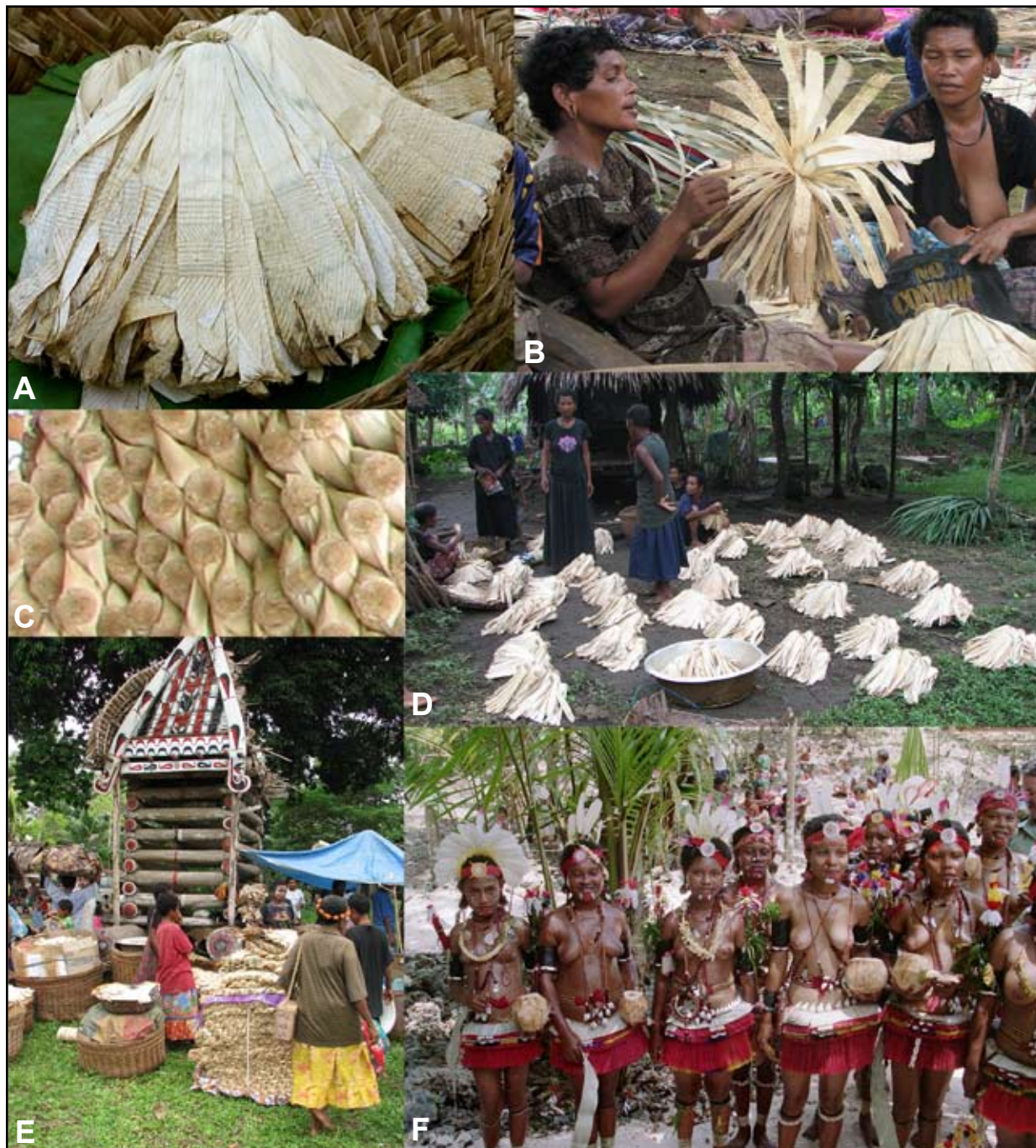
Figure 8. Banana leaf fiber is central to women's wealth ( doba ) in the Trobriand Islands, Milne Bay Province, PNG: A. The strips show decorative imprints; B. Tying prepared banana leaf strips into bundles; C. Close-up of piled bundles; D. Preparing bundles in readiness for a ceremony; E. Piles of doba in front of a yam house during a ceremonial exchange; F. Young women's skirts are also produced from banana leaf strips.

parallel selection for starch production in the corm and pseudostem of Malesian Musa species may also have occurred in the past. There is at least one example of selection for enhanced starch storage in the rhizome of a