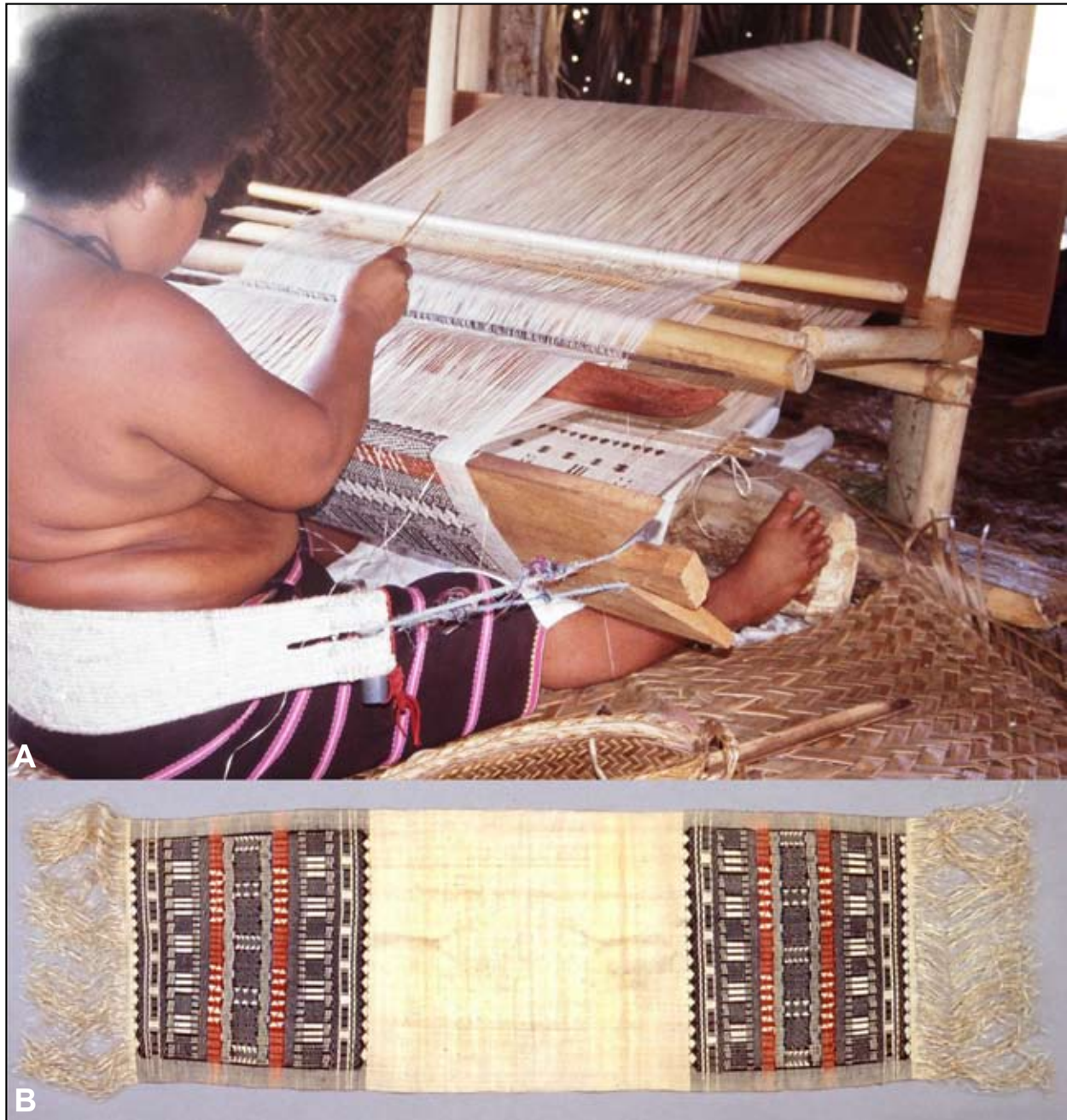
Figure 9. On Fais, in the western Caroline Islands of Micronesia, prestigious traditional textiles called machi are still woven. Fiber from Musa cultivars forms the warp and weft, with decorative supplementary weft of Hibiscus sp. fiber. The ritual value of machi derives from their association with chieftainship. A. Weaving on a back-strap loom; B. Machi .

We should not, therefore, interpret archaeobotanical discoveries of banana parts by reference solely to what we know of the development of edibility in fruit. The cultivation of M. textilis and M. balbisiana for fiber show that seedy fruit is not necessarily an indication of 'wildness'. While parthenocarpy is the key to edibility of fruit, and its reproduction and transmission certainly depended upon vegetative propagation, other desirable characteristics of