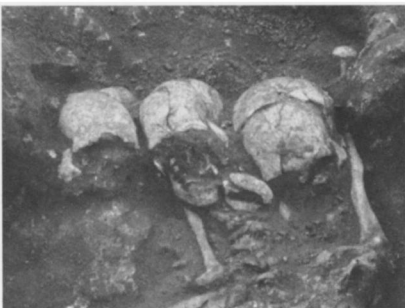
Fig. 1. Teouma Lapita Burial 10: Three crania placed across the chest of a headless male skeleton. From left: 10A♂, 10B♀, 10C♂.

with all articulated skeletons lacking skulls [3]. Only seven crania have been found, and of these only one could be matched to its corresponding mandible. After reconstruction of the fragmented facial bones there was sufficient detail for one full and three partial 2D approximations of four mature adults. Given that Lapita cranial remains are rarely excavated, these four Teouma individuals constitute the most comprehensive evidence to date as to the possible facial appearances of the early Lapita.