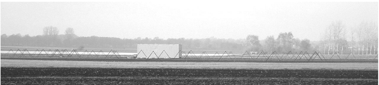
Figure 1. Prototype element antennas deployed at the initial LOFAR test site in Drenthe (Nov. 2003). Each element antenna here is a dual polarization, crossed ñroopy dipoleí installed in a pyramidal mechanical construction made of inexpensive PVC pipe having the first stage, analog processing at the apex. This cluster of 100 elements is connected to receiver units and a small cluster computer in the container for design testing.

The LOFAR system design aims to realize an aperture synthesis radio telescope based on a very large number of low-cost, stationary, all-sky antennas ñ about 15000 initially, to be increased in future as science dictates and funding allows. The design then relies on a distributed, hierarchical, digital signal processing chain to implement the majority of its functionality in software. The resulting instrument has extreme agility in time, in pointing direction and in observing frequency, as well as multiple independently pointable beams and several simultaneous modes of operation. In this section is described the signal processing chain that achieves these functions.