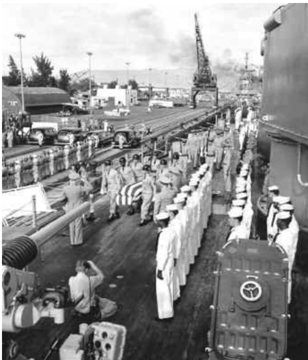
Unloading bones at Kokura