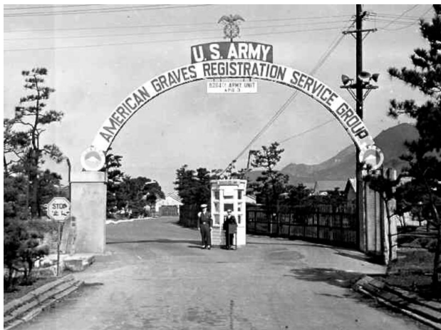
Camp Jono, Kokura, Japan

At the Jono base, the young Japanese anthropologists worked alongside American experts and a team of Japanese labourers brought in to perform the menial tasks of transporting the remains and cleaning the morgue: a place every bit as strange and macabre as the subterranean world depicted in Oë's short story. On busy days, the students examined as many as sixty to eighty corpses a day, most of them severely decomposed because they had been temporarily buried where they fell when US troops retreated before the onslaught from the north, and then unearthed and sent to Japan when the tides of war turned. In words which echo the language of Oë's story, Hanihara vividly evokes the stench of death which hit the workers when they first entered the morgue, and which clung to their clothes and bodies throughout their time in Kokura. And yet, for him, the work had benefits: it was, he felt, a unique opportunity for practical study of the physical anthropology of people of many different races. 'One thing was for sure', he wrote, 'now and probably even in the future it would be most unlikely that we would ever have another chance to examine the bones of hundreds of white people and black people'; and, as it turned out, not only of black and white, but also of Hispanics, Native Americans, Asian Americans and people of mixed race. 12