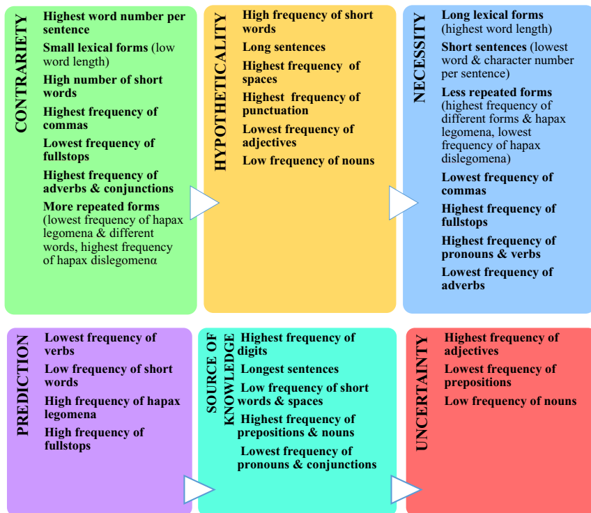
Figure 1: The most important characteristics of the six types of categories in BBC.

In Figure 1, we provide an overview of the stanced sentences in BBC. We summarise the important clues of differentiation among the six stance categories in Figure 1: