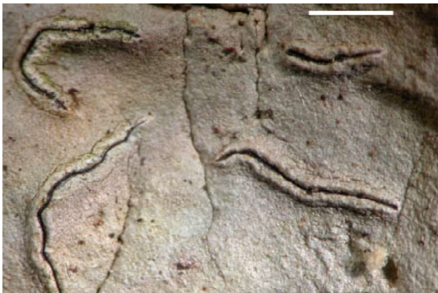
Figure 1. Graphis cycasicola (J.A. Elix 37306, holotype CANB). Scale bar = 1 mm.