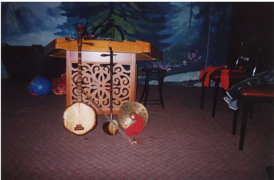
Figure 5 Instruments used in Chaoju Dasi