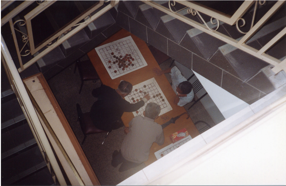
Figure 4 Chinese chess played by elderly members