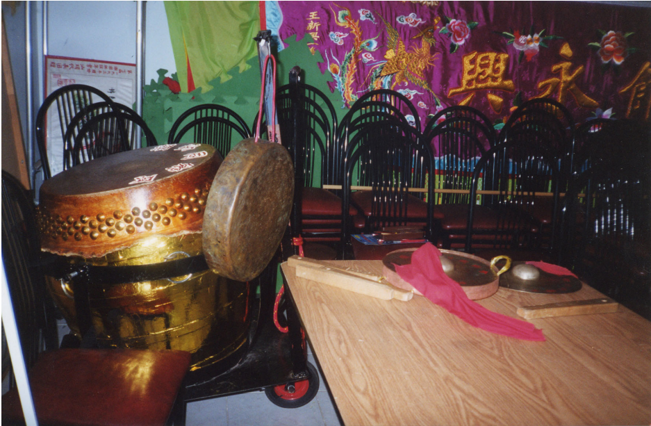
Figure 2 Equipment used in Chinese lion dancing