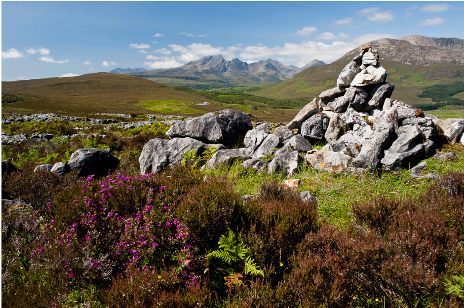
Figure 2 Commemorative cairn in the foreground from the track to the cleared houses of Boreraig, Isle of Skye

This dramatic and dynamic landscape contains all manner of creatures (useful for sustaining human life) and is in a natural, rightful balance when stewarded by its people: strong, brave and cheerful fishermen, hunters and cowherds and gentle, warm, hardworking women—maidens or milkmaids—without blemish. There are also many references to brave stalwart ancestors and heroes. This landscape is indelibly marked by the names given to it by its people so prevalent in the songs, and by numerous commemorative cairns 25 dotted about the landscape.