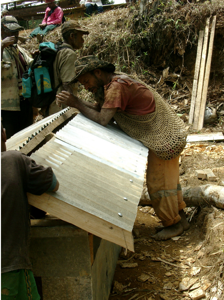
Figure 2 Soti sings against the coffin roof

Yarakatia sweet potato mounds, move the mud, one time will you come back? Mother oh