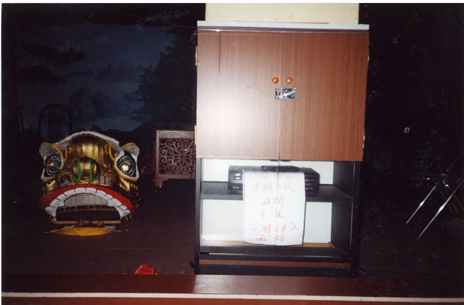
Figure 3 Community Karaoke machine