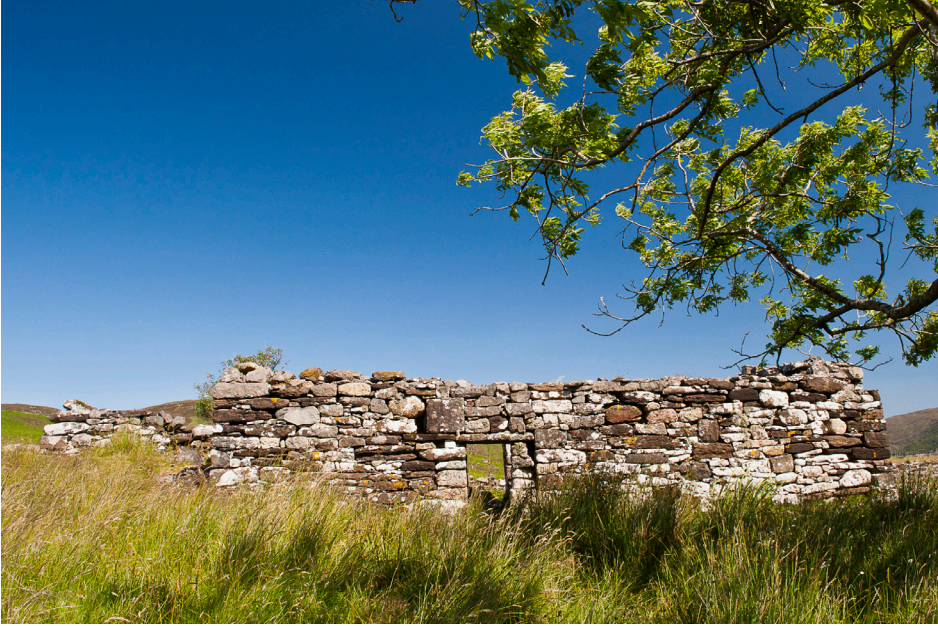
Figure 1 Abandoned house at Boreraig, Isle of Skye, from clearance that took place in 1853 by agents of Lord MacDonald