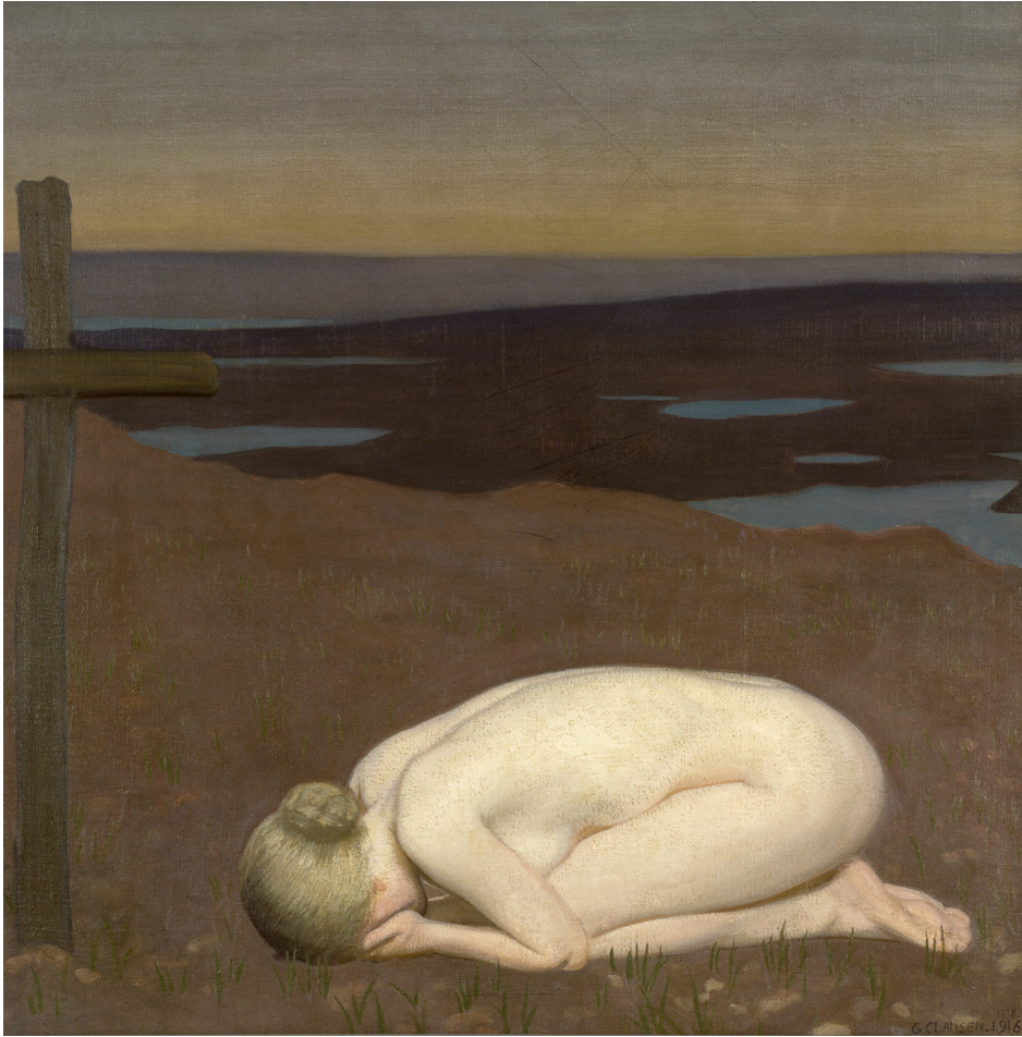
Figure 1 George Clausen, Youth Mourning , 1916