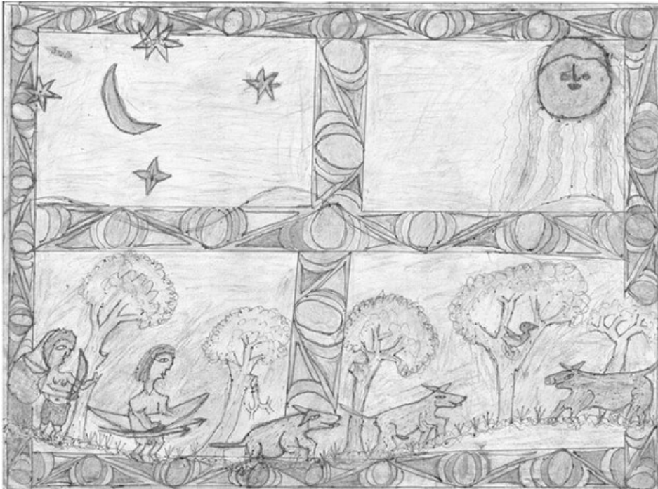
Figure 3 Awiakay man and woman go hunting with dogs