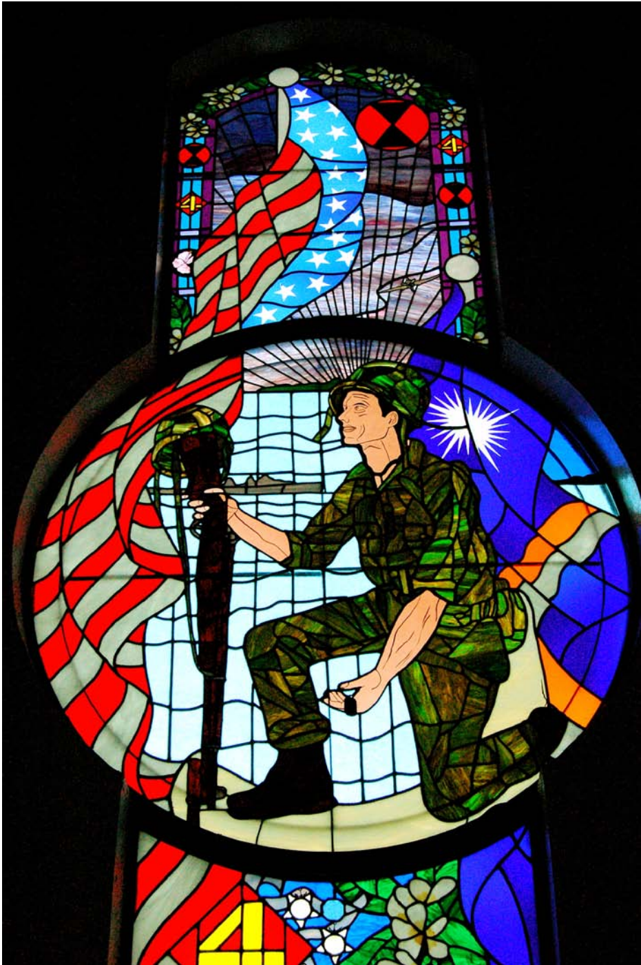
PHOTO 2. Stained glass in Kwajalein chapel commemorates the fiftieth anniversary of the US invasion, depicting a US serviceman kneeling between US and Marshallese flags.