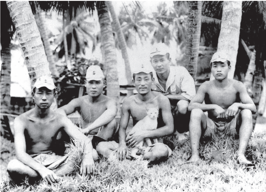
PHOTO 5. Japanese soldiers (names not available) pose with a cat on Kwajalein prior to the US invasion, circa 1943.

What was most revealing about this return of Japanese families to Kwajalein was their encounter with the US base commander at that time, the first woman ever assigned to the post. Wearing full camouflage fatigues, boots, and a beret, she walked around the circle of Japanese, shaking hands