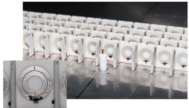
FIG. 1. (Color online) Photograph of the nonlinear tunable metamaterial created by square arrays of wires and nonlinear SRRs. Each SRR contains a varactor (see the inset) which provides power-dependent nonlinear response.

A metamaterial sample (see Fig. 1) is fabricated from 0.5 mm thick Rogers R4003 printed circuit boards with a nominal dielectric constant of 3.4. Our design allows for reconfiguring metamaterial structures by rearranging the same boards. In particular, we make three sets of dielectric boards with the appropriate slot allocations: (i) without any metallization, (ii) with tin coated copper nonlinear SRRs, and (iii) with tin coated copper wires. Combining these