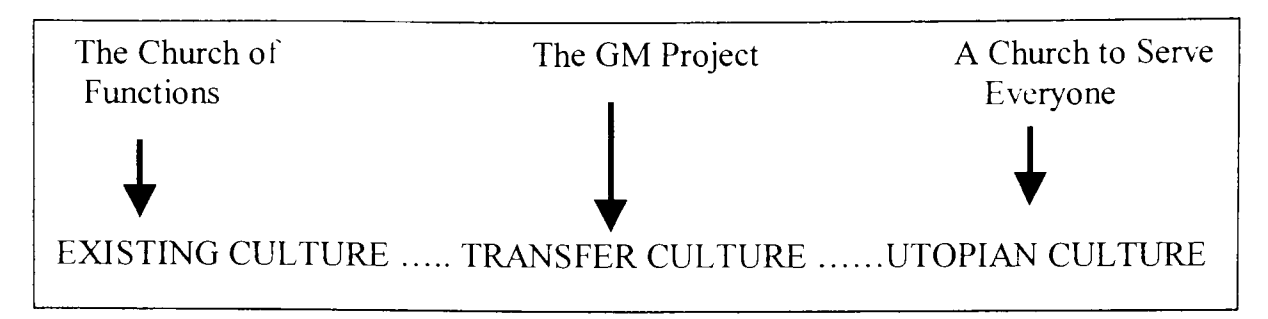
Figure 3. Wallace's Chart of Revitalization

The transferred culture was the system of operations that need to be carried out in the process of transformation. The progressist group in the General Conference led this movement.