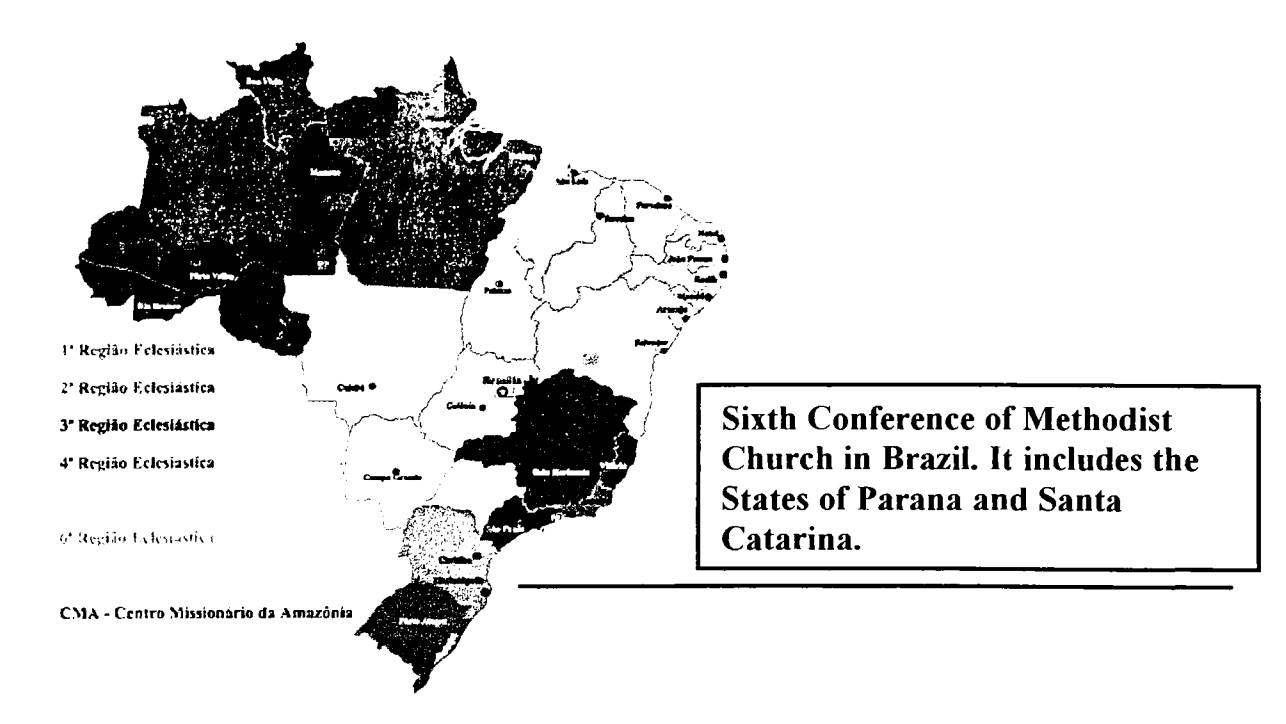
Figure 1. Map of the Sixth Conference

The Sixth Conference is located in the south of Brazil and includes two states: Parana and Santa Catarina. This conference is known as a missionary and charismatic<sup>2</sup> conference. It is missionary because it is involved in mission and charismatic because of the charismatic movement that happened in this conference in the 1980s. As a missionary conference, one can cite two projects. One was the Boia-fria Social Project where the church shared the gospel and social assistance to those in poverty. The other was the Evangelical Methodist Church in Paraguay where a retired layperson went to Paraguay and opened a Methodist church in that country. Both projects were internationally recognized for their success. As a charismatic conference one could cite the characteristic of the worship and celebrations.