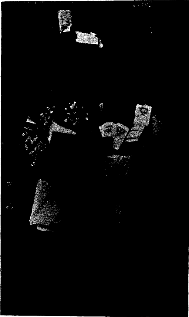
SCRIPTURE READERS AND COLPORTEURS Belonging to the Big Flowery Miao Tribe.